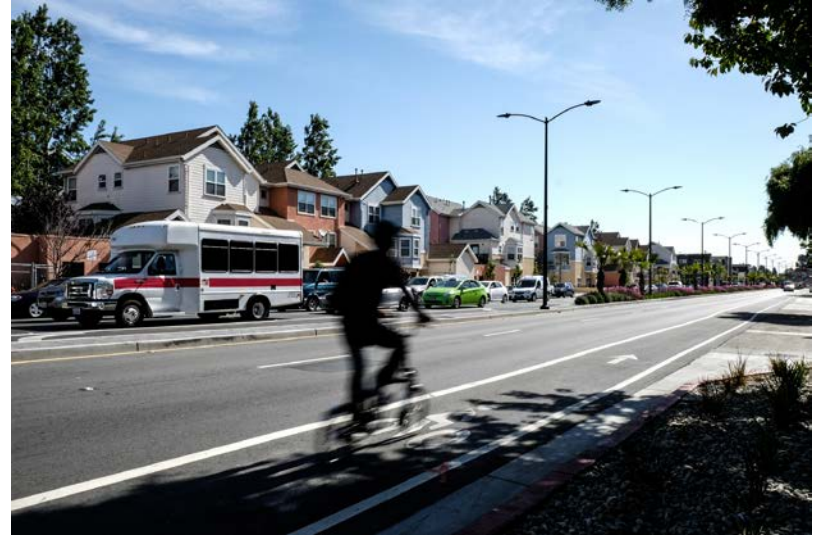
Cesar Chavez Road Diet