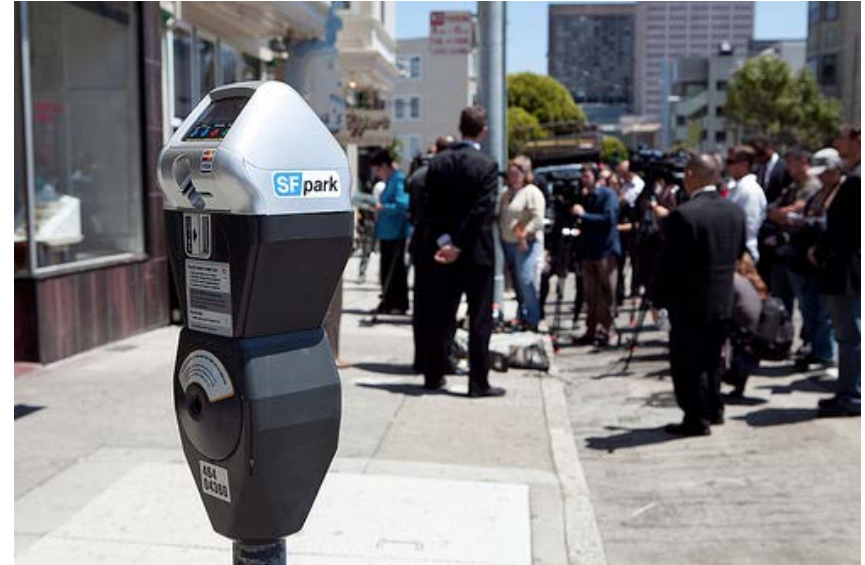
SFpark On-Street Meter