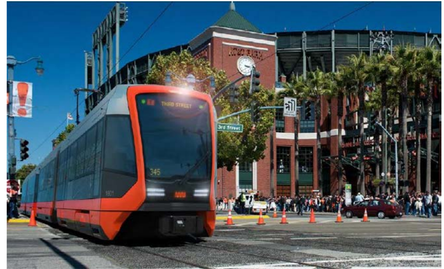
Siemens LRV Rendering