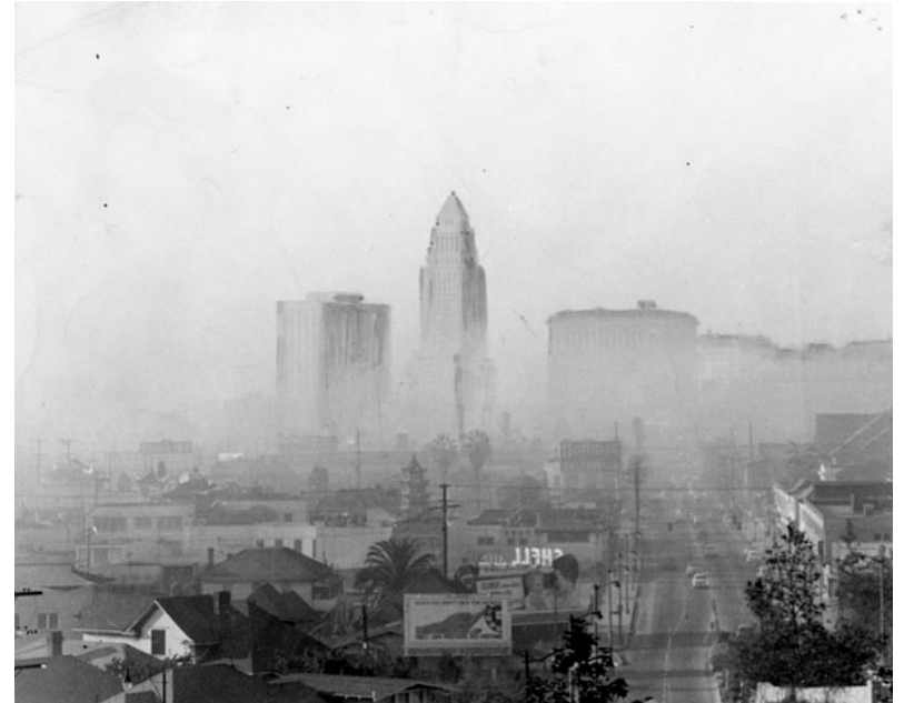
Smog shrouding Downtown Los Angeles, October 1968

MTA Board's role is to ensure discretionary decisions have been reviewed to comply with CEQA before approval.