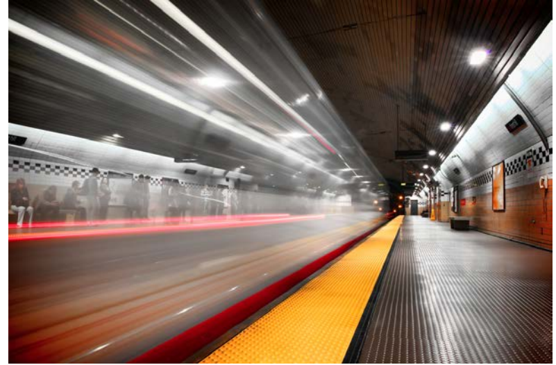
Forest Hill Station