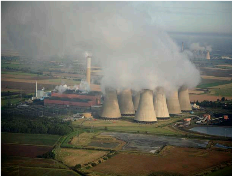
Potentially Harmful Projects

“an activity which may cause either a direct physical change in the environment , or a reasonably foreseeable indirect physical change in the environment ”