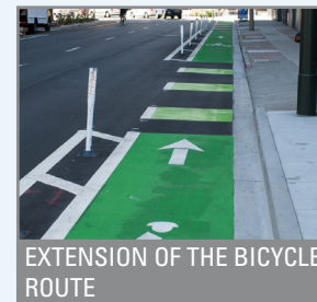
EXTENSION OF THE BICYCLE ROUTE

BENEFITS: Reliable Service, Safer Streets, Rider Comfort, Sidewalk Space