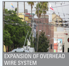
EXPANSION OF OVERHEAD WIRE SYSTEM

Expansion of the overhead wire system allows a direct, zero-emission transit connection between development at Mission Bay and the 16th Street BART Station, the Mission District, and Fillmore Street.