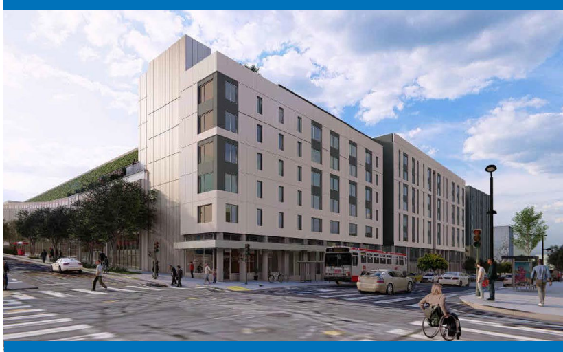
The proposed housing program is subject to funding sources and market feasibility.