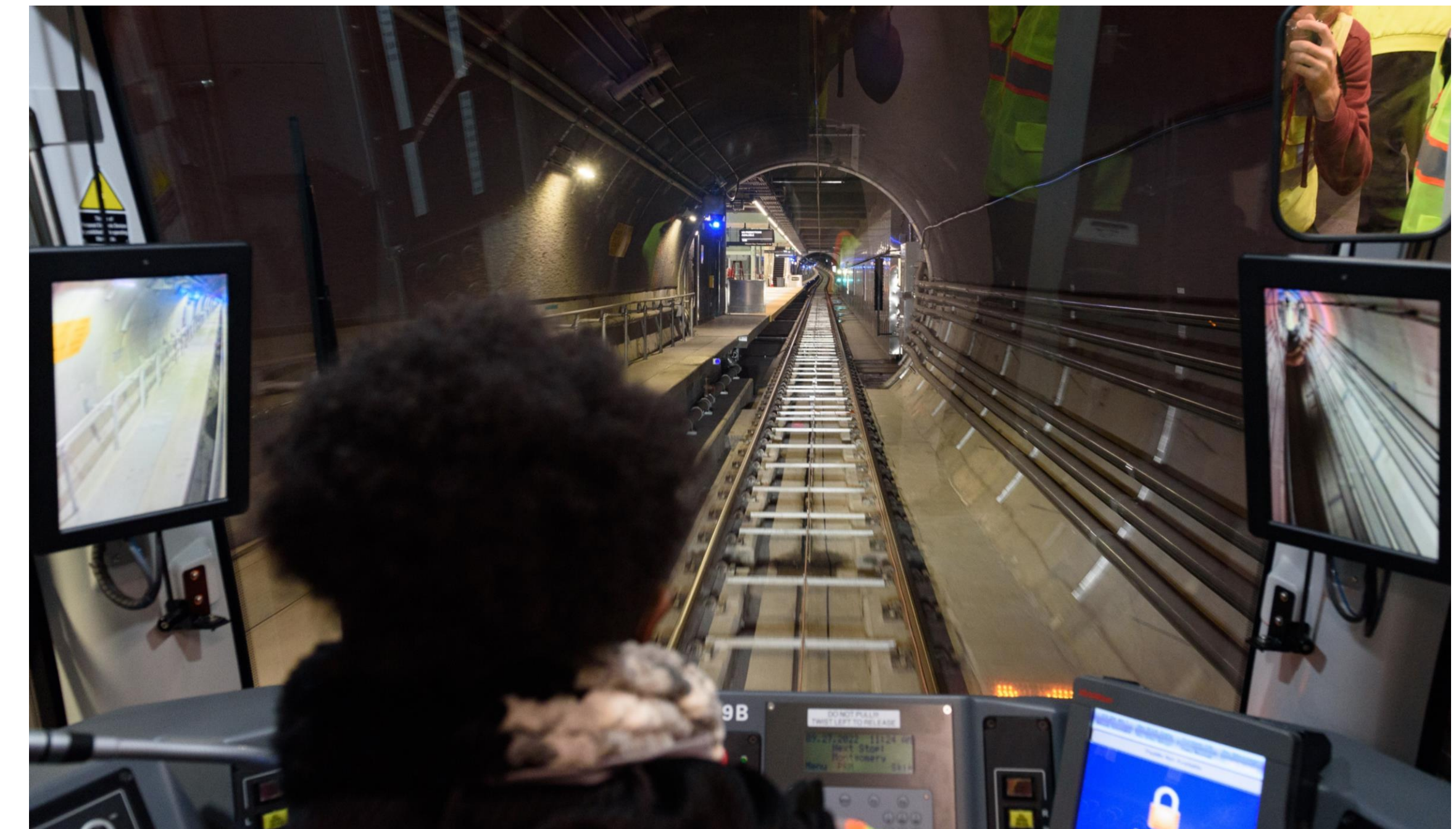
New Larger Side-View Monitors Mean Increased Visibility

LRV4s are 4x more reliable on average than Breda cars. But, more work is underway to meet SFMTA's reliability requirements. SFMTA staff work diligently with Siemens and subcontractors to stabilize performance of accepted vehicles. They also ensure newly manufactured vehicles meet all performance standards.