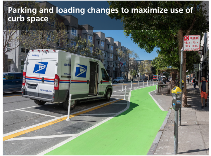
Parking and loading changes to maximize use of curb space