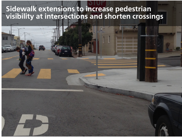
Sidewalk extensions to increase pedestrian visibility at intersections and shorten crossings