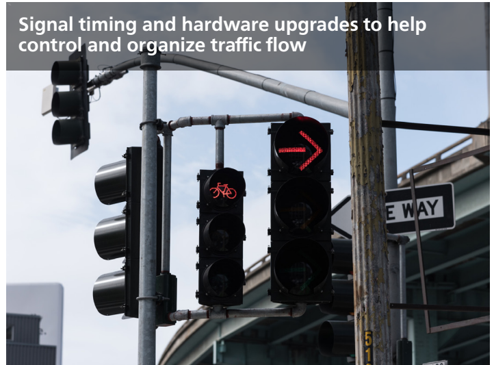
Signal timing and hardware upgrades to help control and organize traffic flow