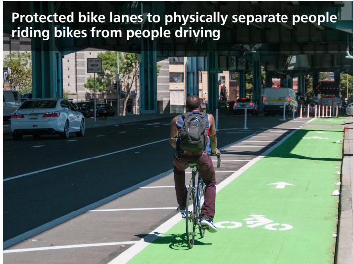
Protected bike lanes to physically separate people riding bikes from people driving