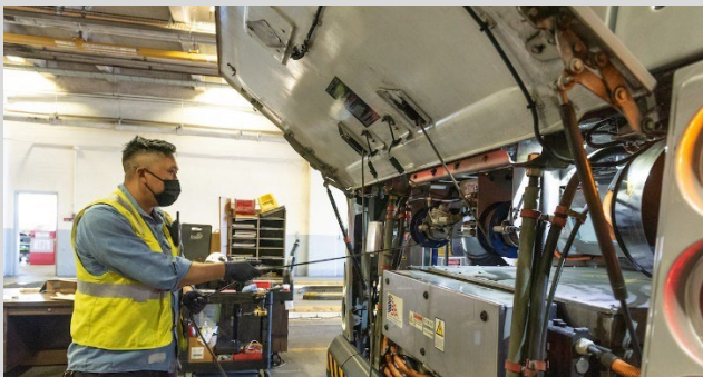
Electrical Technician (with Local 6)

In coordination with our union partners, in year two of the next budget cycle we will launch new apprentice programs: