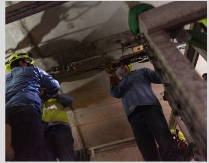
Transit Power Line

During this year, we would also initiate a training program for the Local 261 Track Workers to explore development of an electronic technician program and hire maintenance training and administrative staff to work with our Workforce Development Manager of Apprenticeship, Internship, Fellowship and Job Training Programs.