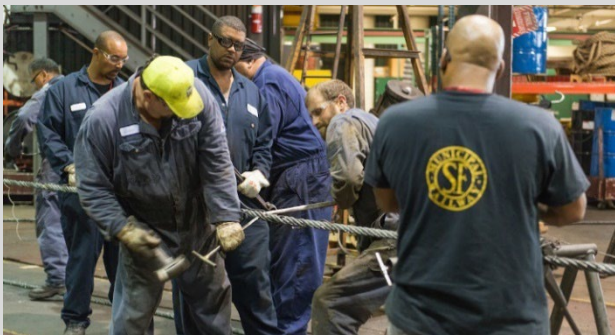
Wire Rope Cable Maintenance (with Local 39)