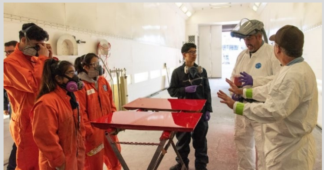
Auto Painter and Autobody/Fender (with Local 1414)

If the Board approves this investment, we expect to have six-to-seven training programs and approximately 45-50 apprentices by the end of the two-year program.