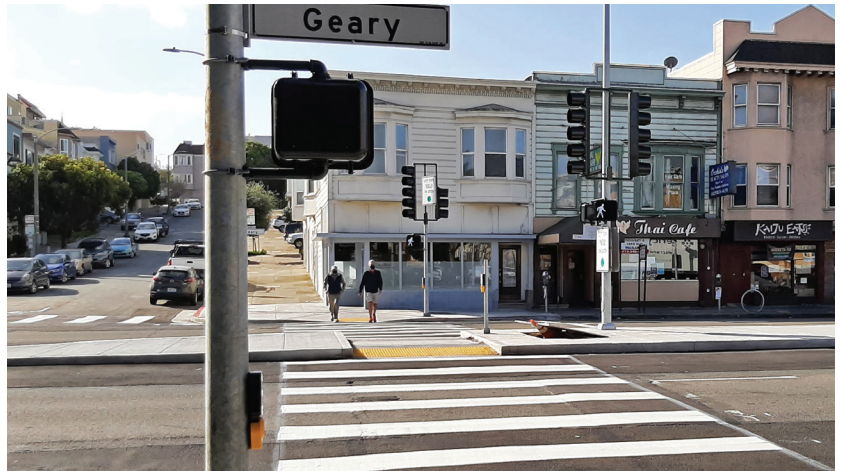
Geary at Commonwealth/Beaumont before and after a traffic signal was installed.