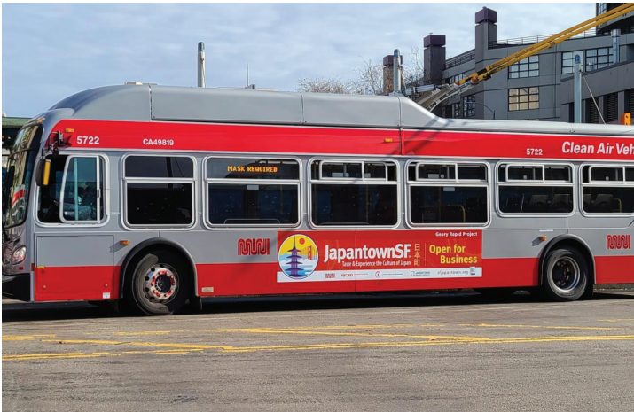
Bus ad produced for Japantown as part of the Geary Rapid Project Business Support Program

The Geary Rapid Project spans many unique commercial corridors, so merchant support needed to be customized to each: Union Square, the Tenderloin, Japantown and the Fillmore. Prior to construction starting in a neighborhood, project staff met with merchant groups and business owners to explain the impacts of construction and determine what type of marketing support would best suit them. For example, Japantown found value in welcoming visitors via an advertising campaign featured on buses throughout the Muni system. And the Tenderloin promoted businesses via targeted Facebook ads.