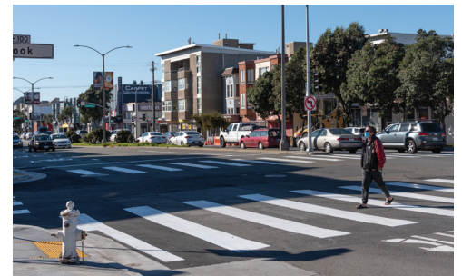
Improved crosswalks at Geary and Cook Street, including new traffic signals, striping and median refuges, creates a safer environment for people walking.

Remaining safety improvements to be completed this summer include a new signalized crosswalk at Buchanan Street, final traffic signal upgrades and roadway restriping to “calm the Expressway.”