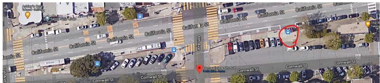
Aerial View of California Street b/w 7th and 5th avenues