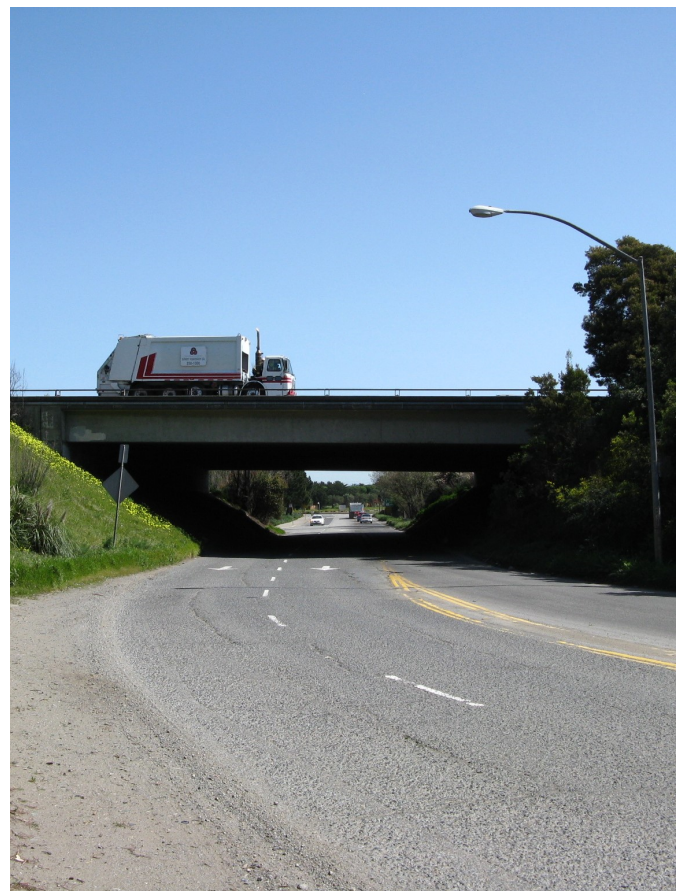
Existing Alana Way