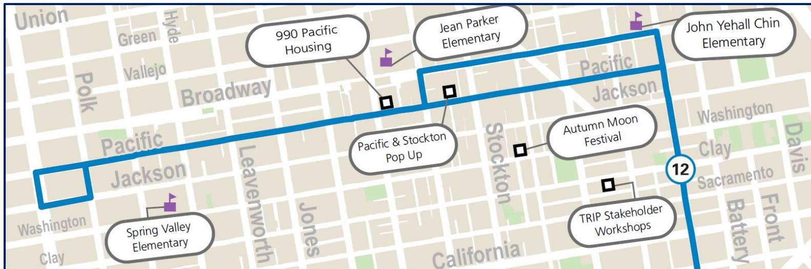
Example of outreach in Chinatown

Chinatown | Financial District | SoMa | Rincon Hill | Mission