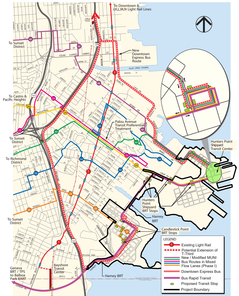
Figure 1: Proposed Transit Improvements

As noted in Chapter 1, the proposed transit service would complement service changes proposed by the Muni Forward, and is illustrated on Figure 1 . As currently contemplated, the relative difference between off-peak and peak period transit service would be similar to the relative differences proposed as part of Muni Forward.