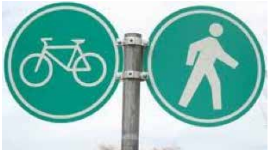
Multi-Use Path Sign, Boston, MA

The location and design of the bikeway on The Embarcadero, are unknown at this time. The constraints of the roadway, which includes the Muni right-of-way, narrow sidewalks on the west side, and the widths of the existing travel lanes, will dictate what design elements are technically feasible. Trade-offs between parking, Promenade width and travel lane width will be defined as part of the design process and the public will help to weigh-in on what they prefer.