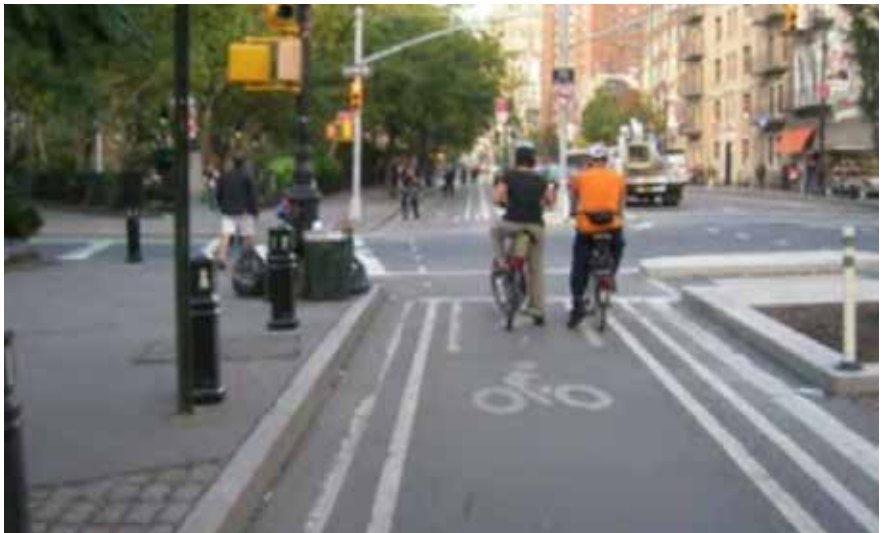
One-Way Bikeway, 8th Avenue, New York City

A bikeway, also known as a cycle track, is a physically separated bicycle facility that is distinct from both the roadway and the sidewalk. By separating cyclists from other road users, bikeways can offer a higher level of security than traditional bike lanes and attract a broader spectrum of the public, including tourists, children and less confident people on bicycles. These facilities can also increase safety and comfort for all road users by minimizing potential conflicts between those on foot, bicycle or in a vehicle, and by adding predictability to roadway operations.