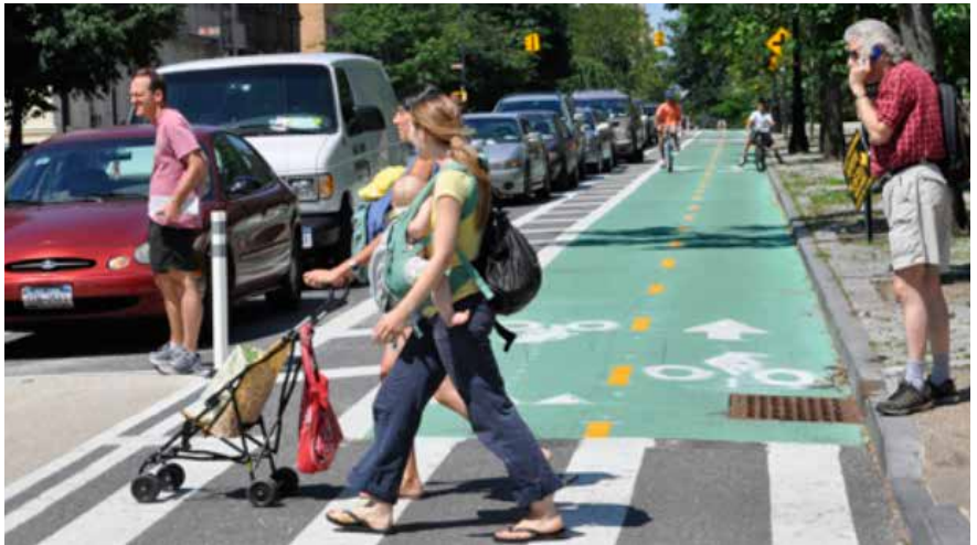
Improvements on Prospect Park West, New York NY

Travel data collected on The Embarcadero illustrate the high level of demand for walking and cycling. Data collected by Gehl Architects who helped to develop pedestrian-oriented improvement plans for Jefferson Street in Fisherman's Wharf, found that portions of The Embarcadero at Pier 39 have higher pedestrian volumes than some of the busiest pedestrian corridors in the world, including Broadway in New York, George Street in Sydney, Australia, and Regent Street in London, England.