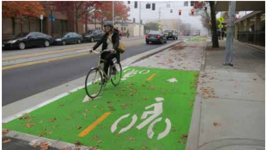
Two-Way Bikeway, Seattle, WA

As requested, members of the Project Team will have individual meetings or will give presentations about the project at neighborhood or other scheduled group meetings with sufficient advanced notice.