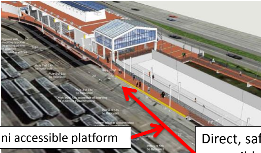
Muni accessible platform