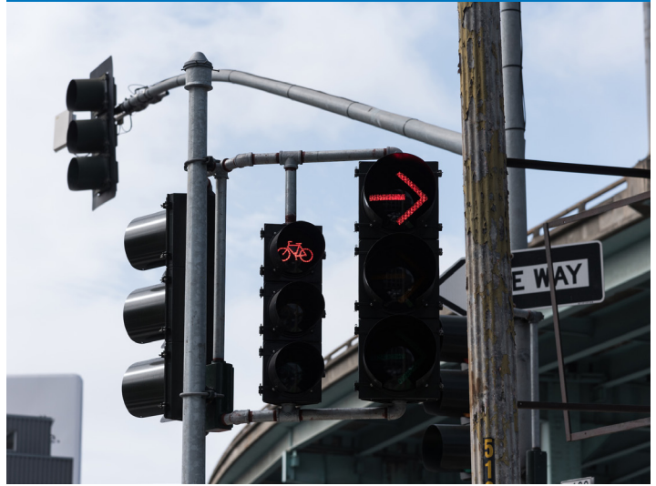
Signal timing and hardware upgrades to help control and organize traffic flow