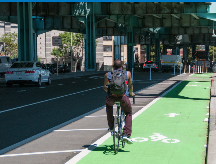
Protected bike lanes to physically separate people riding bikes from people driving