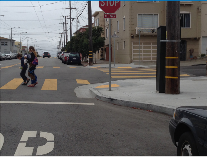
Sidewalk extensions to increase pedestrian visibility at intersections and shorten crossings