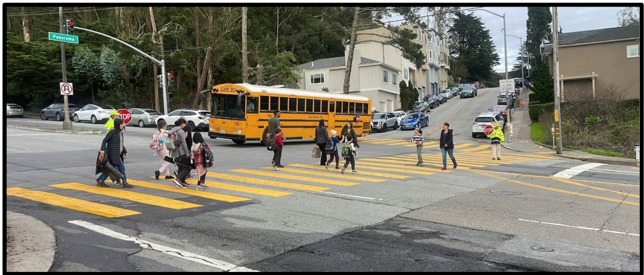
Photo of Clarendon Elementary School students crossing Clarendon Avenue with the help of two SFMTA crossing guards.

As existing, Clarendon Avenue is overly sized for existing vehicle traffic volumes, with two lanes in each direction for most of the project area, allowing people driving to dangerously speed. Traffic speeds are a primary factor in injury collisions on Clarendon Avenue and installing a single vehicle lane in each direction and adding edge lines, the roadway is visually narrowed, and people driving will move slower. This will help reduce collisions along the corridor and make a safer transportation environment, including for students attending Clarendon Avenue Elementary School, located along on the corridor. Right-sizing the roadway will also match the one-lane configurations that feed Clarendon Avenue on both ends: east of Johnstone Drive and at Laguna Honda Boulevard. Given the existing traffic volumes on Clarendon Avenue, the lane reductions will not significantly impact traffic flow.