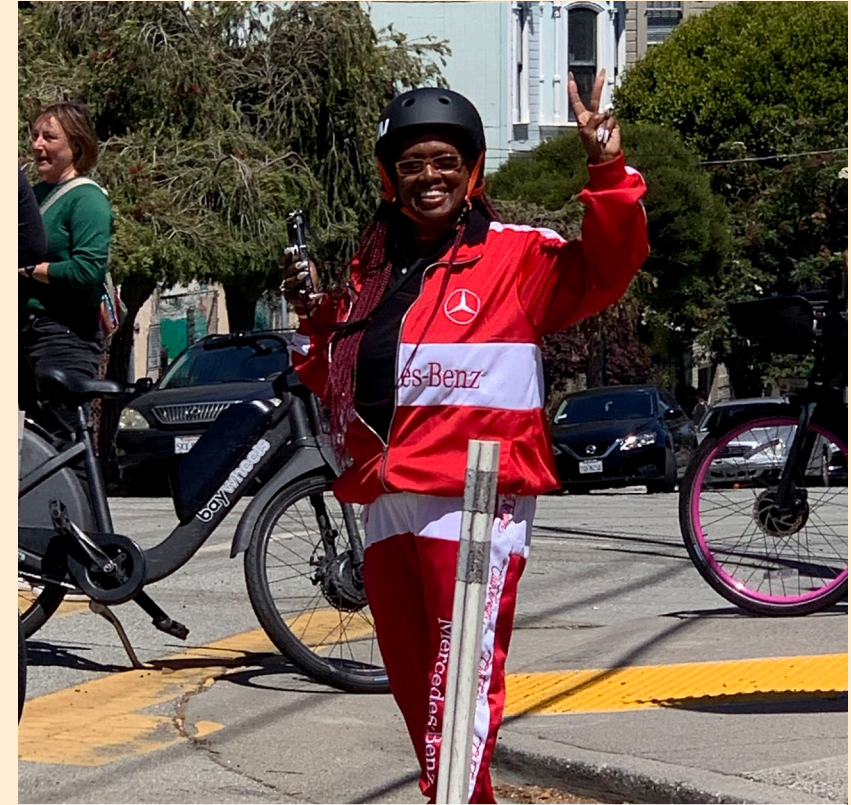
7/28 Fillmore Community Ride

Center needs of Equity Priority Communities, residents with a disability & other vulnerable users