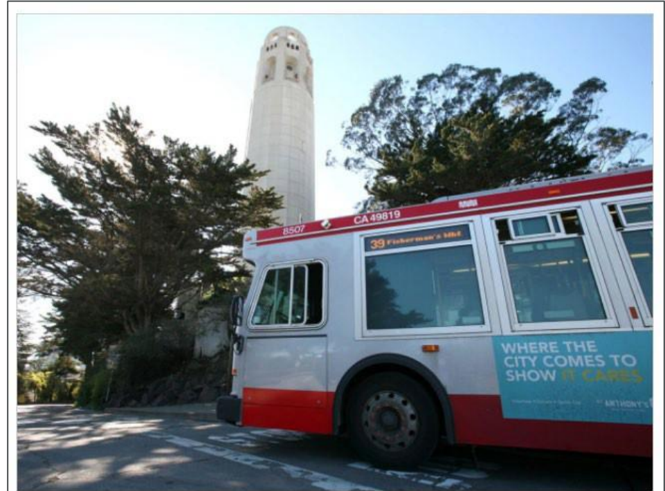
The 39-Coit Muni bus stops to pick up people traveling visiting Coit Tower in North Beach on Feb. 13, 2018.