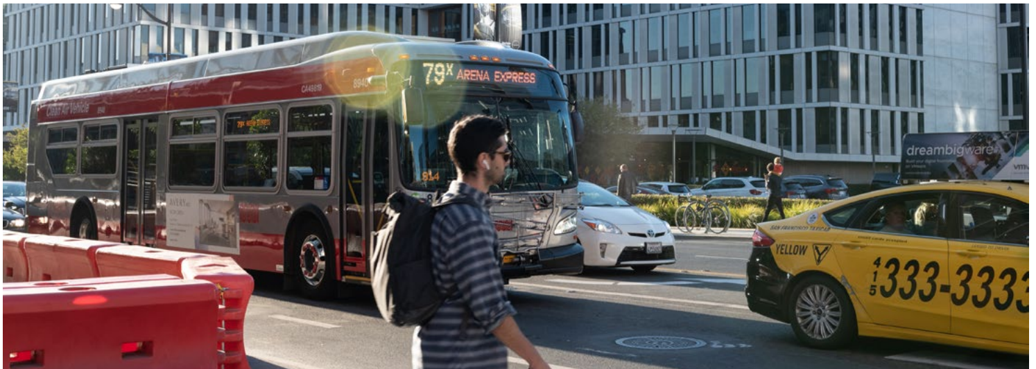
New 79X Muni shuttle service line takes customers to Chase Center.

At the end of Chase Center events, both routes will drop off at 16th Mission BART stations, and the 79X Van Ness Arena Express will continue on to make stops along Van Ness Avenue beginning at Mission and continuing to North Point.