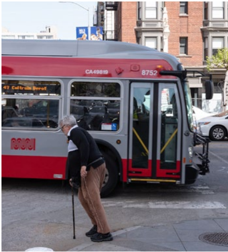
Safety improvements are making Van Ness more accessible.