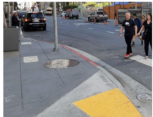
Pedestrian bulbs help make people walking more visible to cars and shorten crossing distances.

Access to businesses will be maintained throughout, and there will be pedestrian detours.