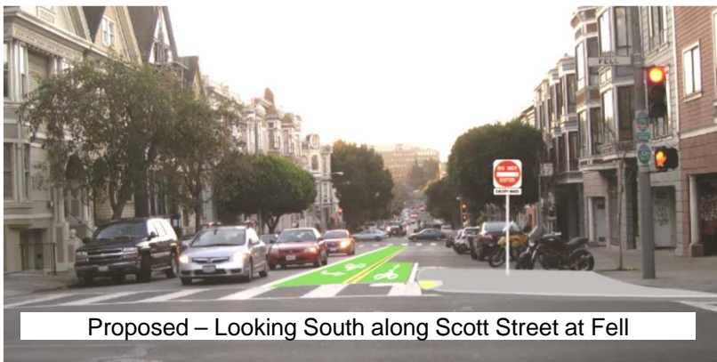
Proposed – Looking South along Scott Street at Fell

This location was originally identified by an application by neighbors for traffic calming on Scott Street, and was recommended for diversion to address collisions and congestion in response to priorities identified by several San Francisco plans including Vision Zero, the Green Connections Plan and the Bicycle Strategy.