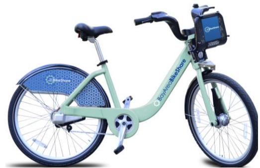
Bay Area Bike Share Bike