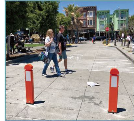
Collapsible bollards were tested in 2018.

East side of Patricia's Green and daytime hours only