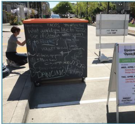
Passers-by wrote comments with ideas for what they'd like to see on Octavia.