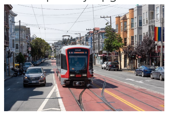
Better signal priority and preemption

Transit lanes and other transit priority upgrades