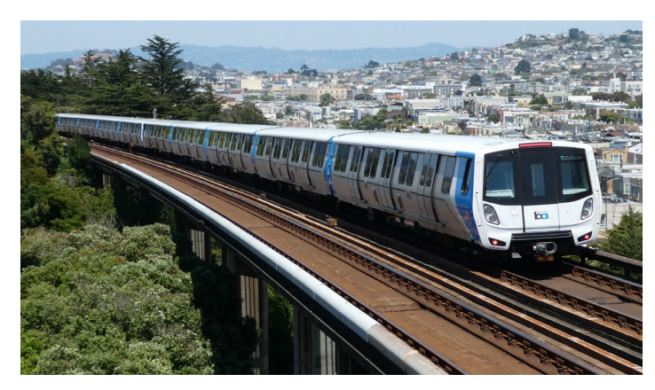
BART: $1,170 million federal grant