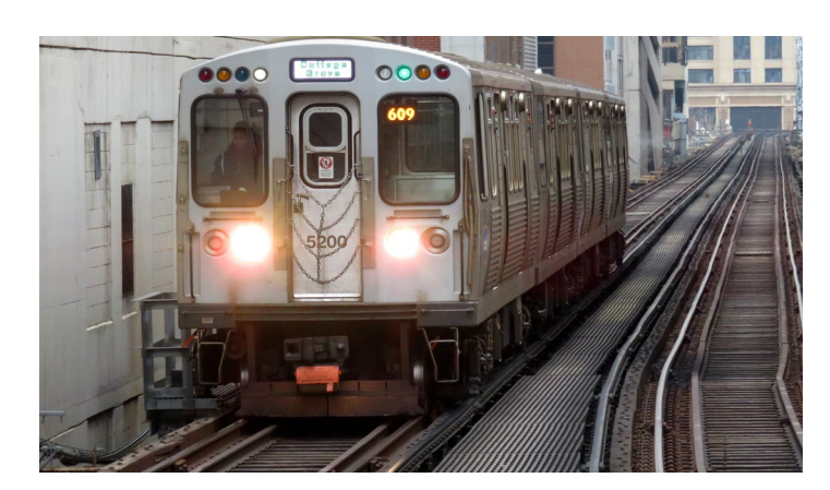
Chicago: $957 million federal grant