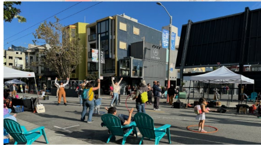
Saturdays in the City, HVNA