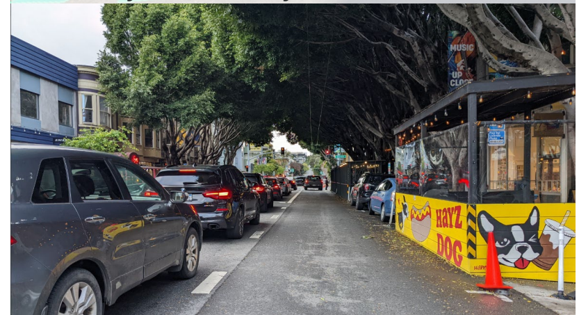
300 Block Traffic, March 2024