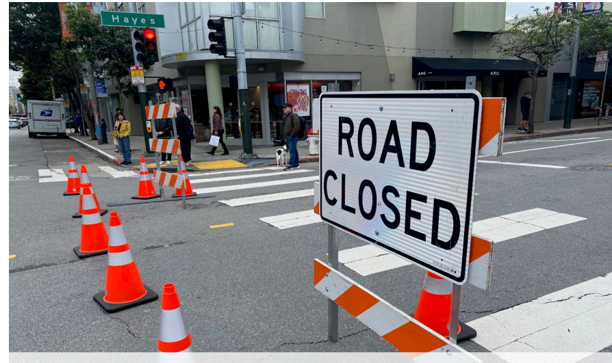
Gough intersection barricades, February 2024