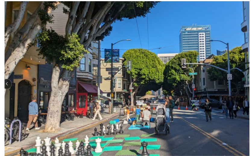
Saturdays In The City, October 2024

Applicant requests restoring pandemic hours for a greater diversity of events, earlier event start times and expanded brunch service.