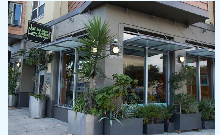
Shops on 3 rd Street