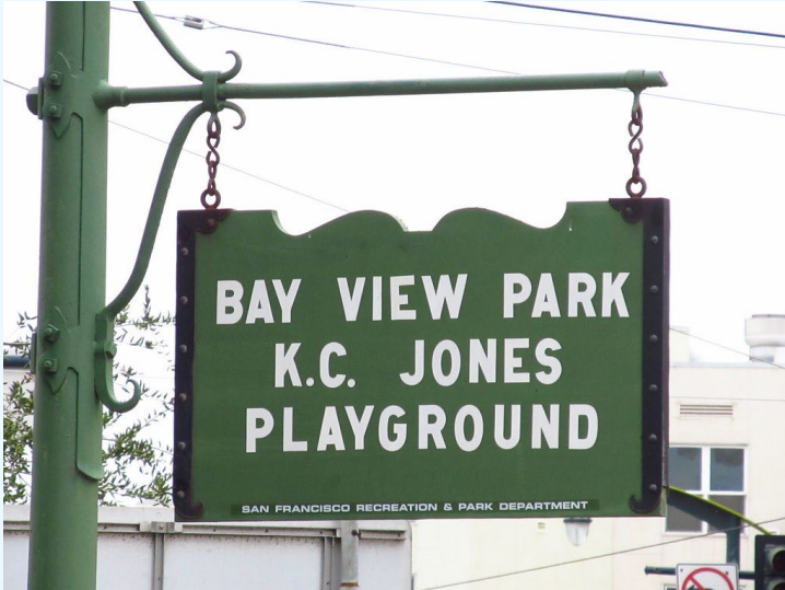
Bay View Park

What kind of trips would you take on a Community Shuttle?