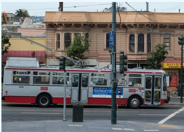
T-Third & 15 BVHPX Muni Line