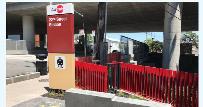
22 nd Street Caltrain