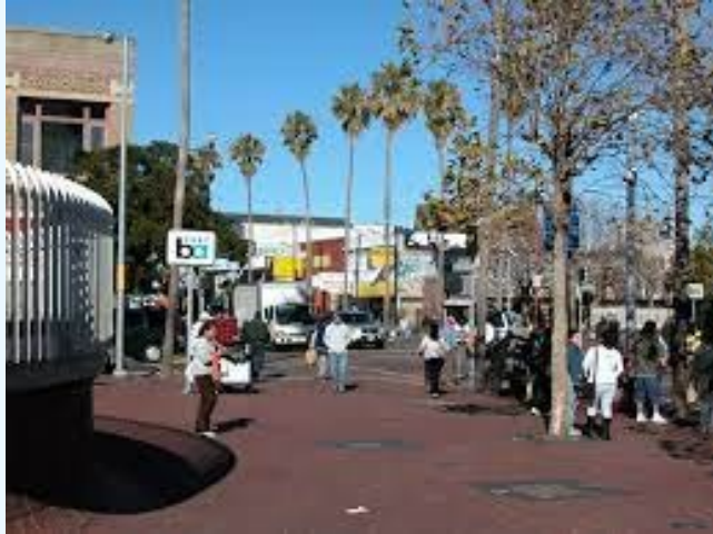
24 th Street BART

What kind of trips would you take on a Community Shuttle?