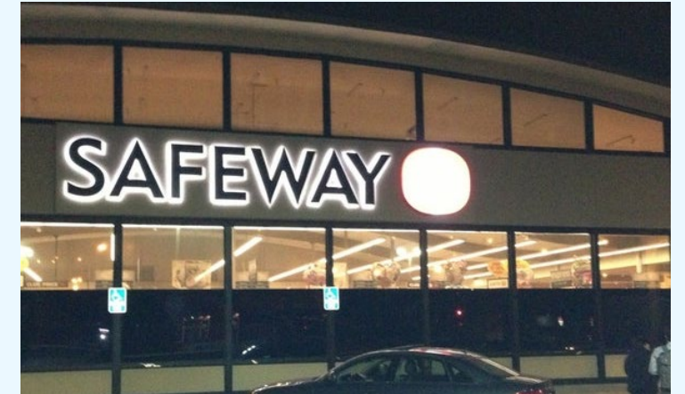
Bernal Heights Safeway