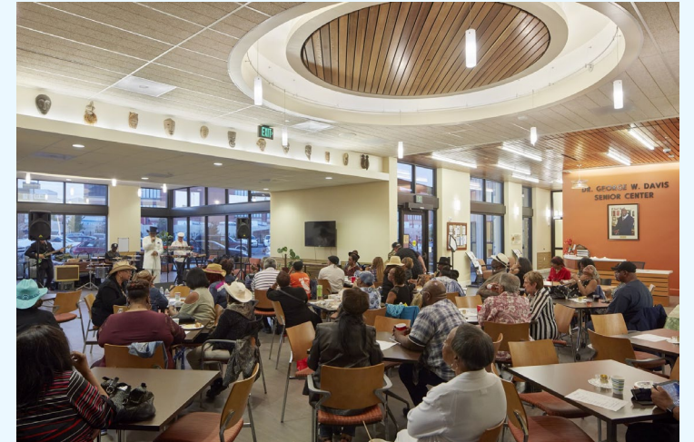
Bayview Senior Center