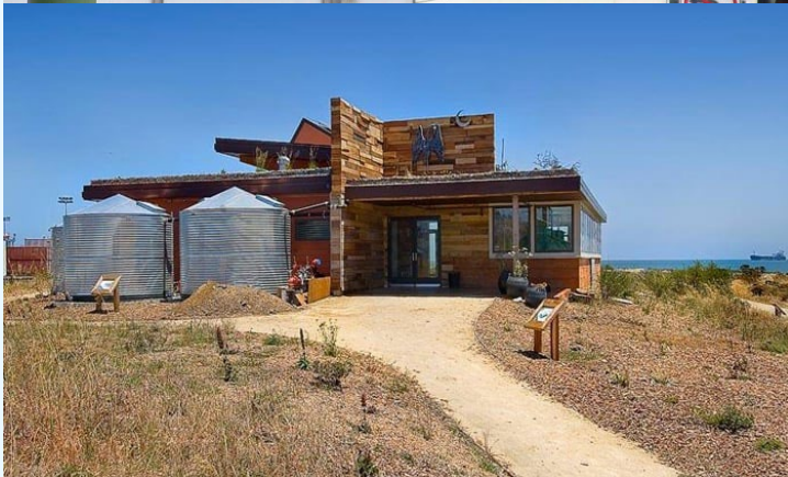
Heron's Head Park & EcoCenter