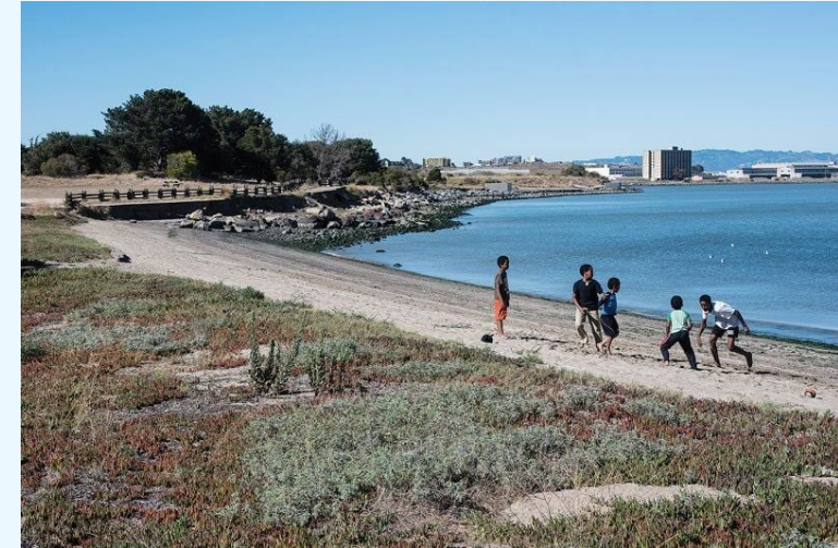
Candlestick State Park