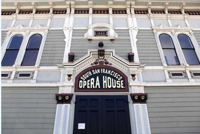
Bayview Opera House

What kind of trips would you take on a Community Shuttle?