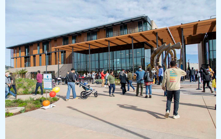
Southeast Community Center