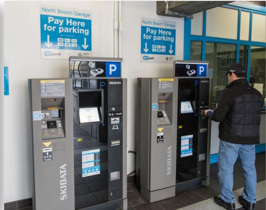
Customer Using New PARCS Payment Equipment at North Beach Parking Garage