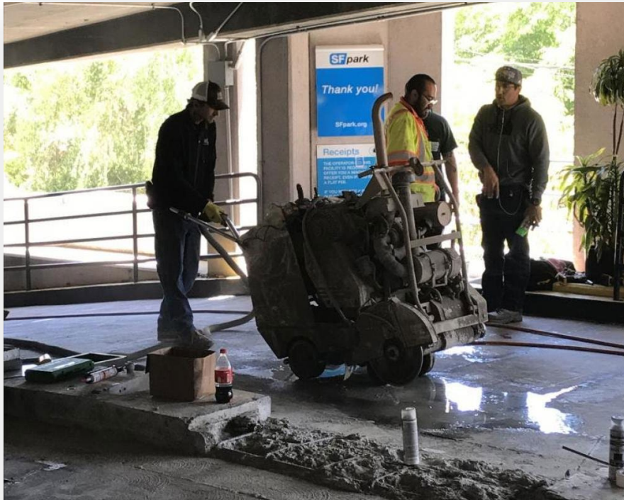
PARCS Installation Under Construction/Lombard Street Garage