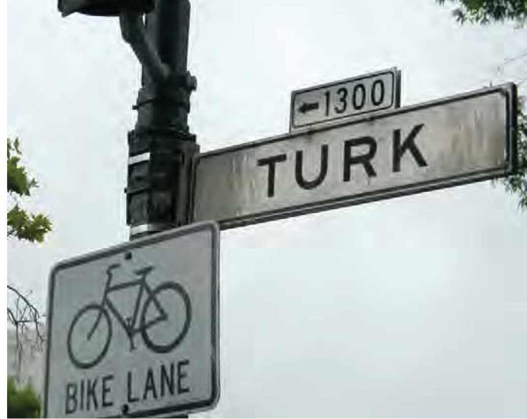
Turk Street Sign

As major east-west city connectors, Turk Street and Golden Gate Avenue experience high vehicle speeds and are part of the Vision Zero High Injury Network. Community members identified McAllister as their most used east-west corridor, heavily used by all modes with issues such as commute congestion and unsafe pedestrian conditions due to cyclists and motorists failure to yield to pedestrians. McAllister Street also hosts a Muni Rapid route, the 5R-Fulton Rapid and a heavily used westbound bike route during the evening commute. Rectangular Rapid Flashing Beacons (RRFB) are solar-powered lights at the side of a roadway that flash when activated by push button. These signals help increase pedestrian visibility by notifying drivers and cyclists to yield to crossing pedestrians. RRFBs should be considered for installation on Turk Street, Golden Gate Avenue and McAllister Street at the Octavia Street mid-block crossings.