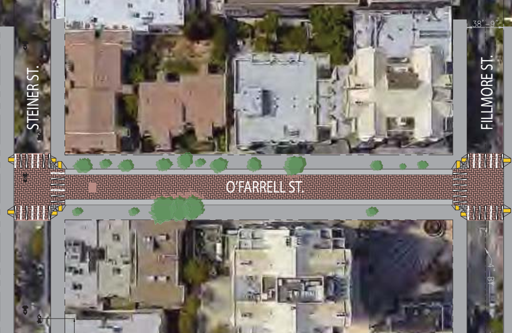
Figure 5-4: Plan View of Conceptual Fillmore Community Connections Recommendation.

streets that account for 70% of traffic collisions. The project aims to design a safer and more comfortable walking and biking environment on the stretch of Turk Street from Market to Divisadero. The Western Addition portion of the project will have a separate outreach process to engage community members in a future design for the corridor, which may include a westbound bike facility pending community support.