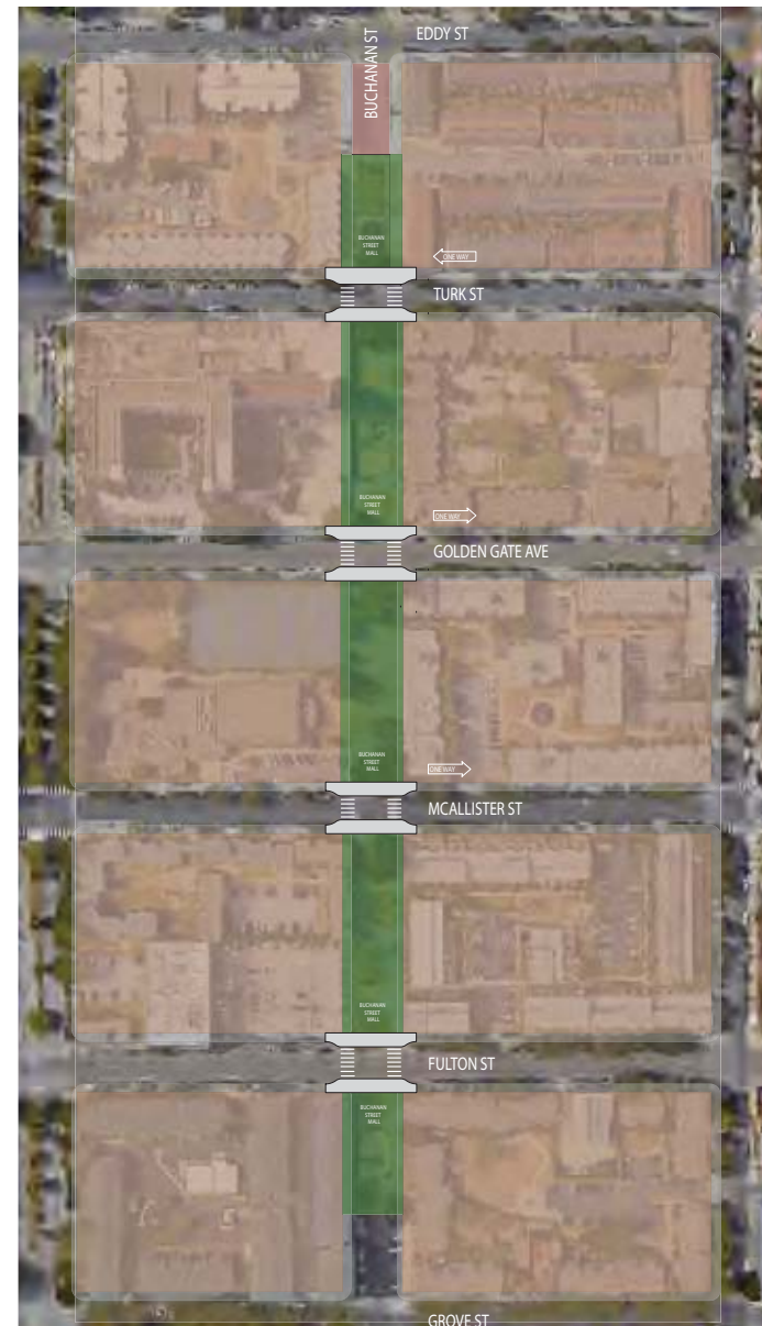
Figure 5-6: Plan View of Conceptual Buchanan Mall Community Connections Recommendation.

The Buchanan Mall runs north-south between Grove and Eddy Streets and consist of five consecutive blocks of green space, three playgrounds, a half basketball court and pedestrian paths. The Buchanan Mall is primarily a pedestrian space and does not provide vehicle access. This Community Connection project would serve to enhance the connectivity of the mall from Eddy to Fulton Streets by reducing pedestrian crossing distances, improving pedestrian visibility and reducing vehicle speeds along these corridors. The project would propose a suite of improvements to the Buchanan Mall from Eddy to Fulton Streets.