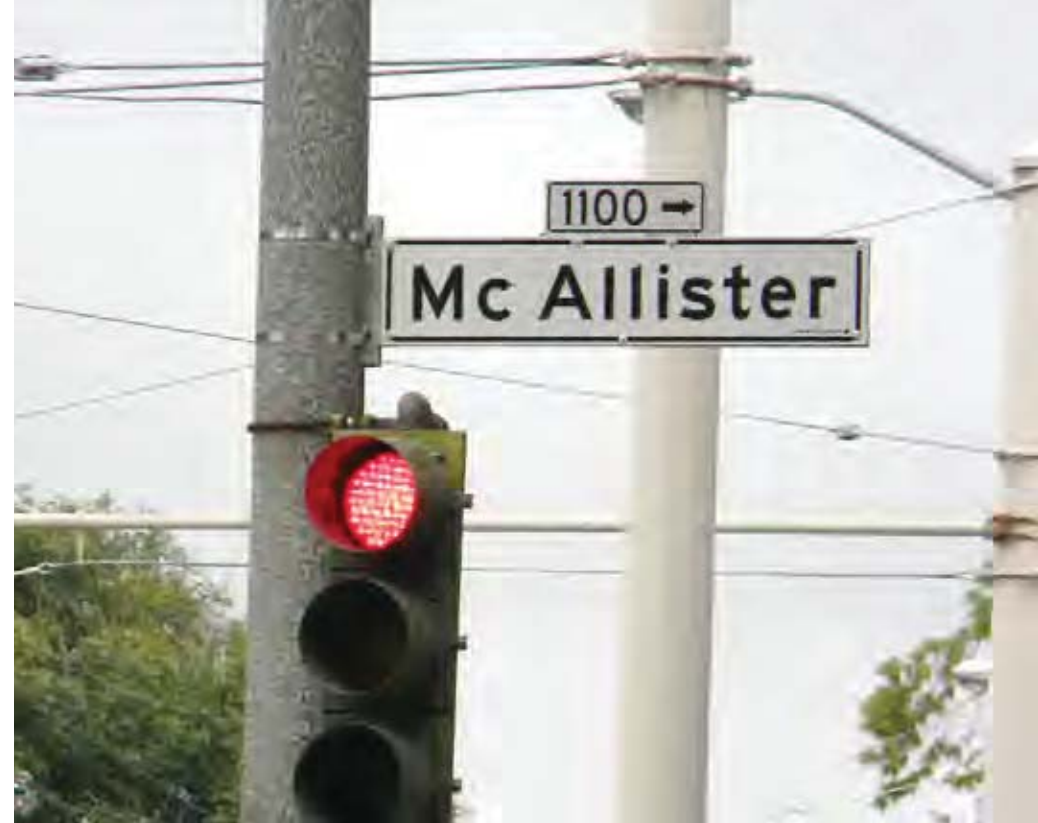
McAllister Street Sign

Western Addition is a transit rich neighborhood served by 12 Muni routes, three of which are part of the rapid network, with 4 minute peak frequencies and three operate with 24 hour service as part of the late night owl service. The highest ridership route in the neighborhood is the 22 Fillmore, which carries over 15,000 customers per day. The 5/5R and 24 are also high ridership routes. The community identified