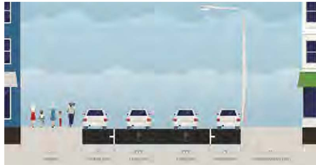
Figure 5-3: Cross-section of Recommended Turk Street Edge Lines.