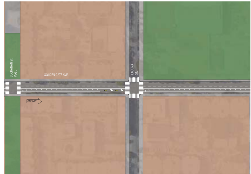
Figure 5-2: Plan View of Conceptual Golden Gate Avenue Road Diet Recommendation.

Consistent with the Vision Zero and WalkFirst initiatives, the Turk Street Safety Project targets this High-Injury corridor, which is one of 12% of