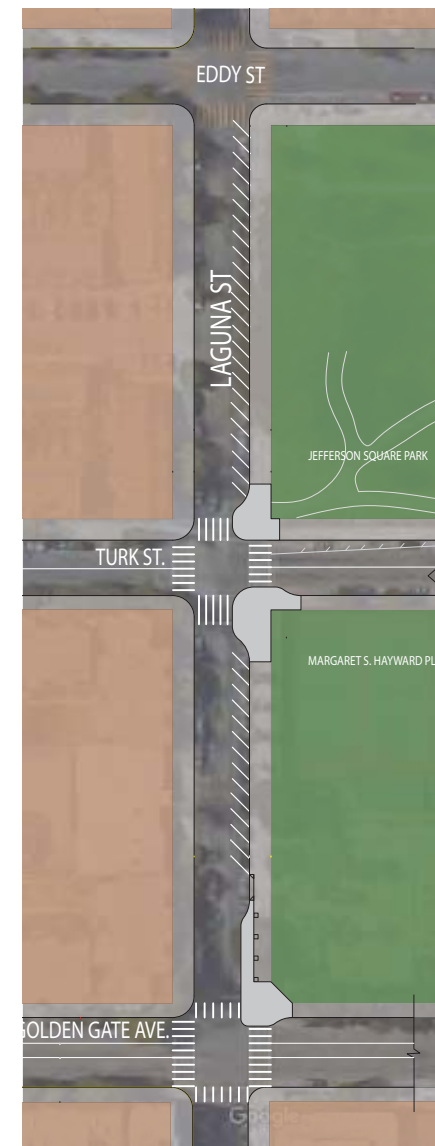
Figure 5-5: Plan View of Conceptual Fillmore Community Connections Recommendation

The large pedestrian bulbs on the east side of Laguna Street, adjacent to these recreational facilities could be outfitted with new green plantings to enhance the aesthetics of this pedestrian space. The specific landscaping would be determined by the Department of Public Works (DPW) landscape