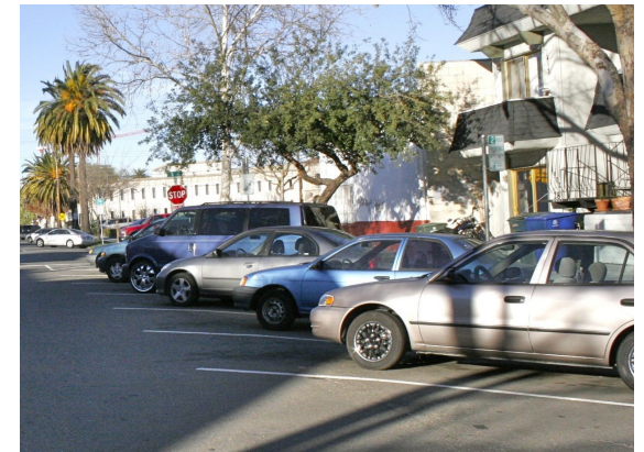
Back-in Angled Parking (Kirkham to Lawton streets)