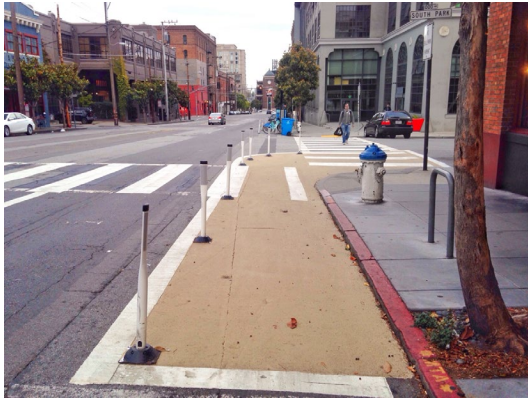
Painted Safety Zones (PSZ)