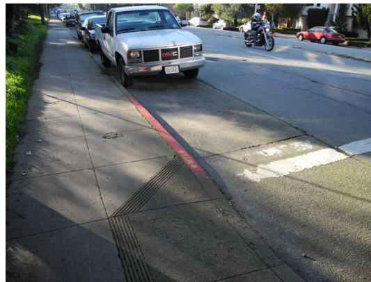
Pedestrian Visibility Zones (Daylighting)