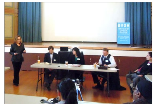
The Vehicle Sharing Workshop panelists explained how vehicle sharing programs are successful in San Mateo, Napa County and Portland, Oregon.