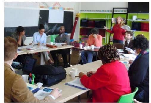
The Transportation Working Group had many engaging discussions, moderated by technical experts, such as the one pictured here at the February 2013 meeting.

Tuesday May 21 11am-12pm City Hall, Room 250