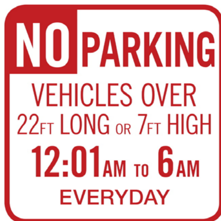
Figure 3: Oversize vehicle overnight parking prohibition sign

Approximately 700 signs are left in stock for maintenance and further use.