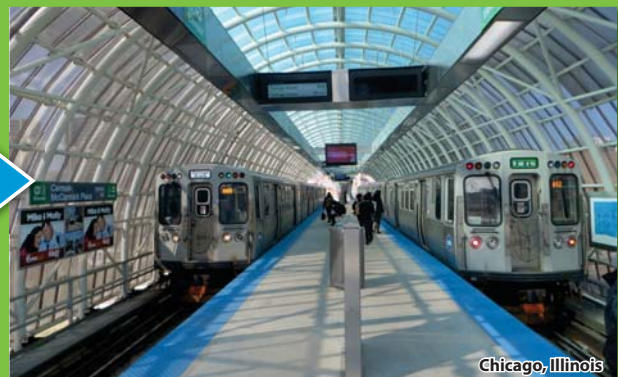
Improved lighting and sight lines contribute to a safer, more open station environment, as in the example above.