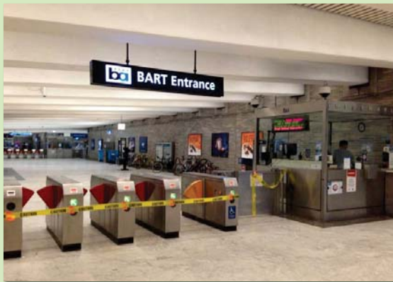
Aging station components and infrastructure lead to periodic service disruptions.