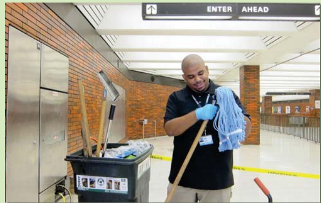
Increased investment in upkeep and maintenance helps keep BART running.