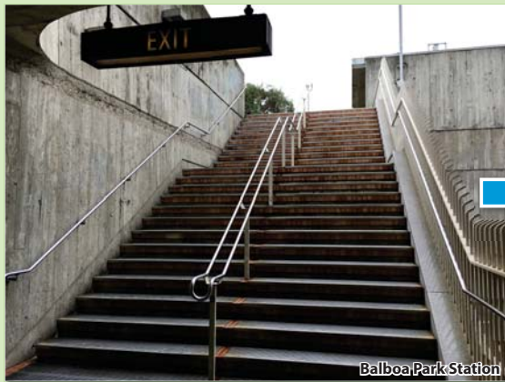
Existing station conditions