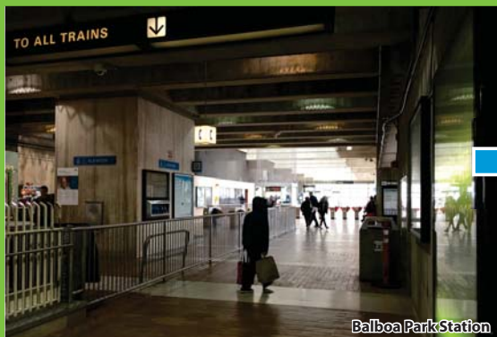
Existing station conditions