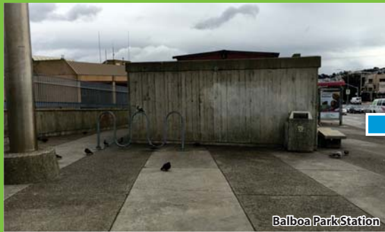
Existing station conditions