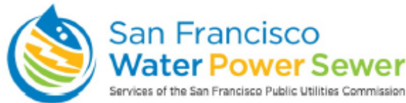
EXHIBIT A-5S SERVICE CONNECTION CHECKLIST