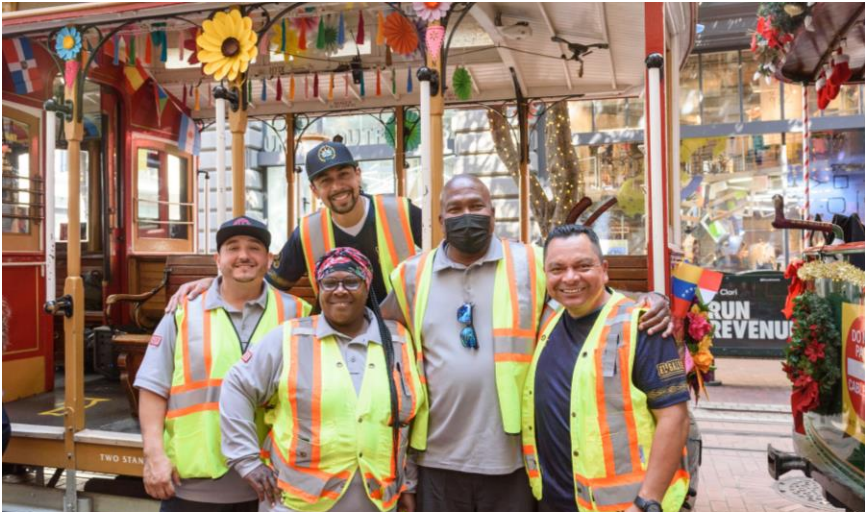
Improved organizational culture