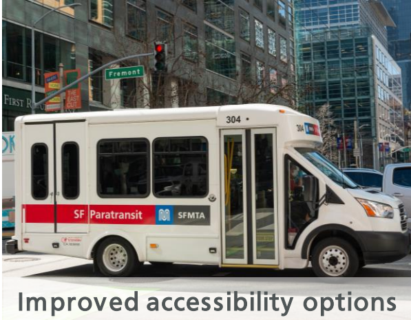
Improved accessibility options