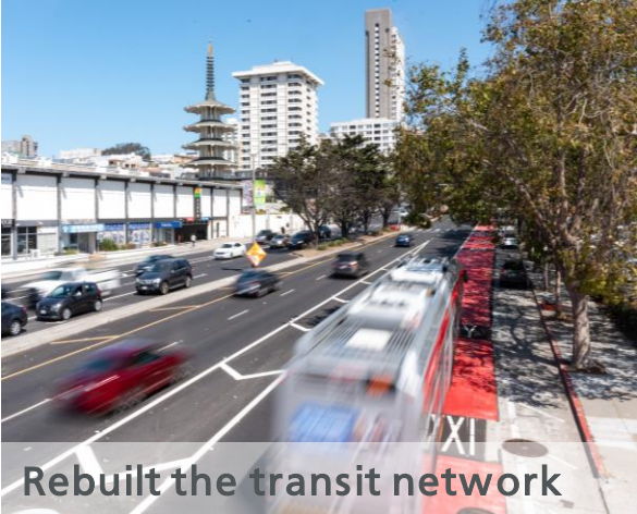
Rebuilt the transit network