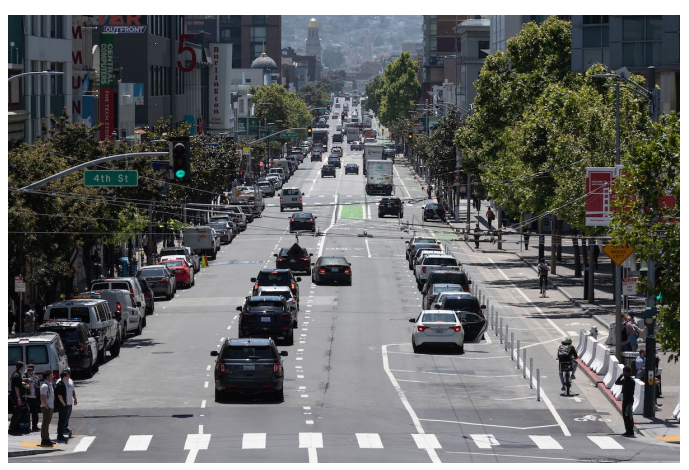
Howard Street at 4th Street, looking westward

San Francisco's 2018 Central SoMa Plan approved an additional 16 million square feet of space for new transit-oriented housing and jobs over the next 25 years. The Howard Streetscape Project is a central component of the Plan and will dramatically improve street design to better serve current residents while also accommodating planned growth.