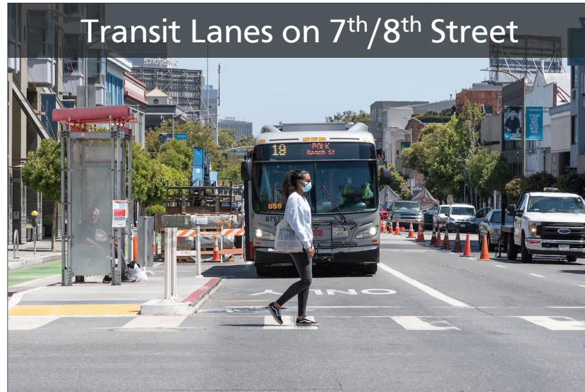
Transit Lanes on 7 th /8 th Street