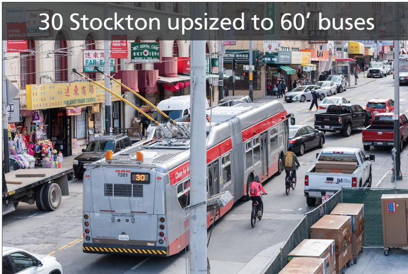
30 Stockton upsized to 60' buses