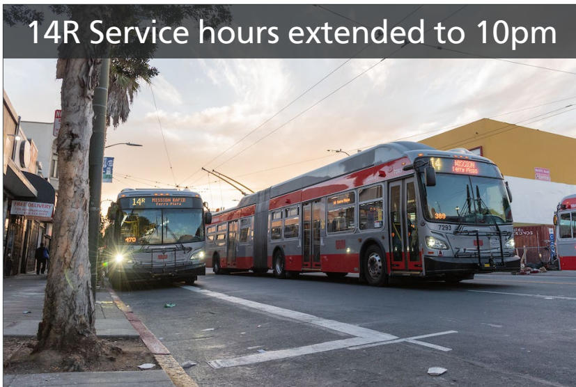
14R Service hours extended to 10pm