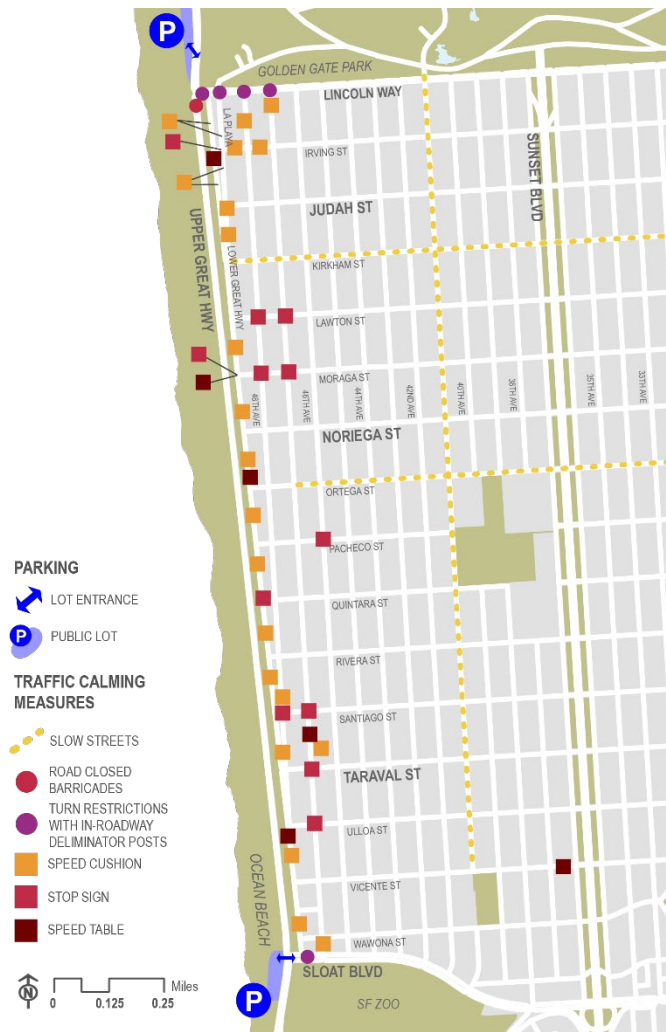
Map 2: Traffic calming and diversion measures during the COVID-19 pandemic