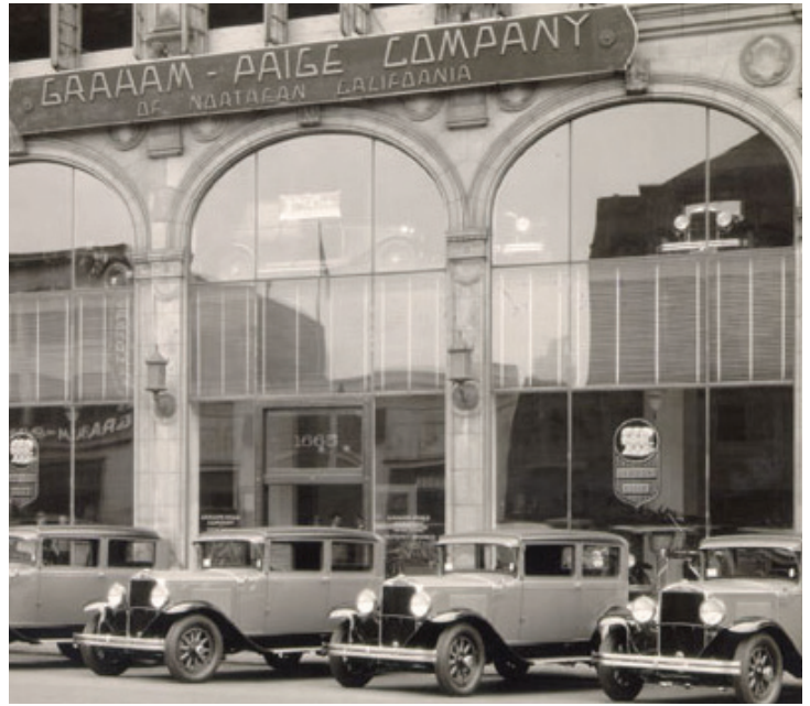
Located at 1699 Van Ness Avenue, the Paige (later Graham-Paige) luxury auto showroom was regarded as one of the finest when it was built in 1919.

In September 2013, the Board of Supervisors, acting as the San Francisco County Transportation Authority Board, unanimously approved the Van Ness Bus Rapid Transit project.