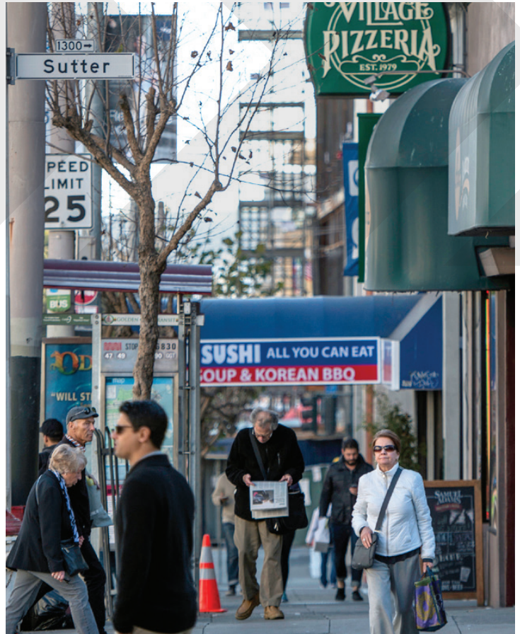
With approximately 45,000 jobs and 25,000 housing units, Van Ness Avenue is one of the region's major commercial centers.

For more information about the Van Ness Business Advisory Committee, go to "Meetings" at sfmta.com/vanness .