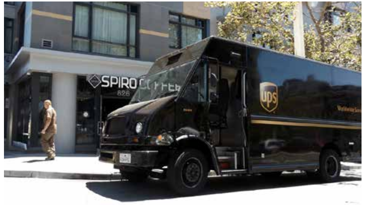
The Van Ness Improvement Project is working with corridor businesses to minimize the adverse effects of construction.

Although these old stop locations have been legislated to become metered parking, it would be costly and ineffective to