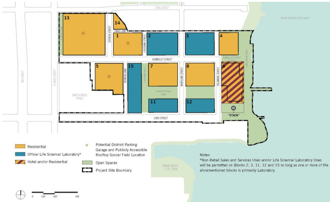
Figure 3 PPS Land Use Plan