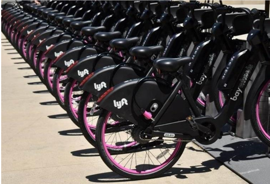
Figure 9 Bay Wheels Dock

PPS plans to make adequate space available for bike share at the site. Access to bike share will be provided in high-traffic areas near key buildings and site entrances, facilitating easy and convenient use of the bike share system. This will serve to further reinforce the site's multimodal brand.