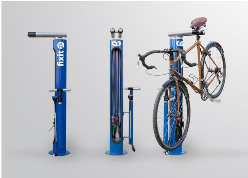
Figure 6 DERO Bicycle Fix-it Station

Implementation. Each new building will install a regularly maintained bicycle fix-it station similar to the one shown in Figure 6 in or immediately adjacent to bicycle storage. The bicycle fix-it station will be fitted with a fix-it pole or other mechanism to hold bicycle for repair, appropriate tools, and bicycle-related information, each in the manner required by the Design for Development.