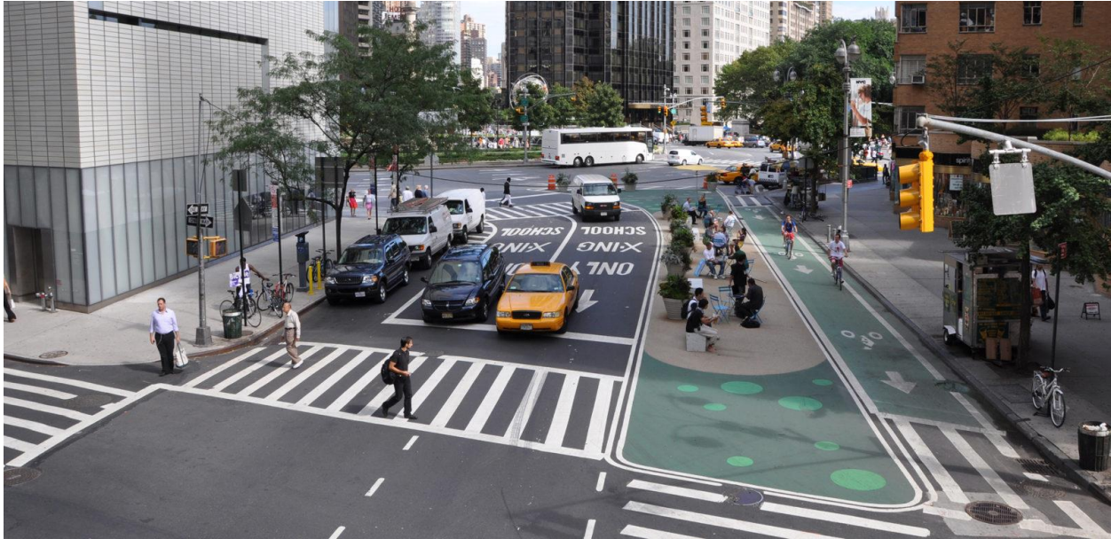
Figure 5 Complete Streets Design Features