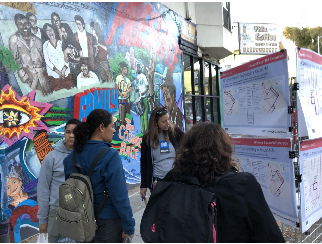
Figure 2: Pop-up open house at Folsom and 16th Street bus stop

proposal to bring Muni service to Rincon Hill. The East Cut Community Benefit District in Supervisor District 6 has been a major stakeholder advocating for the proposal. While residents of Rincon Hill are generally supportive, some stakeholders expressed concerns over reduced service along Second Street. The 10 Townsend, however, will continue to serve these existing stops at 15-minute scheduled frequency.