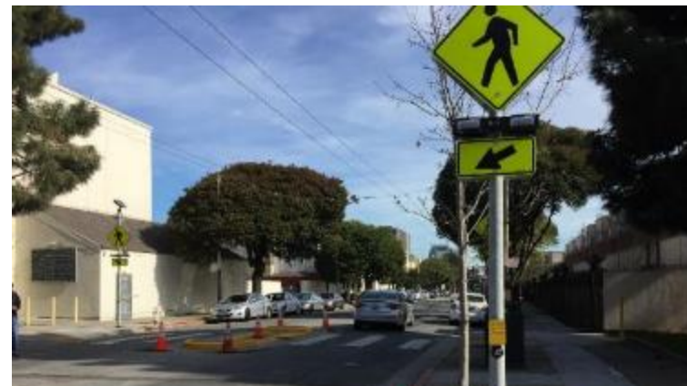
Ped island and flashing beacon