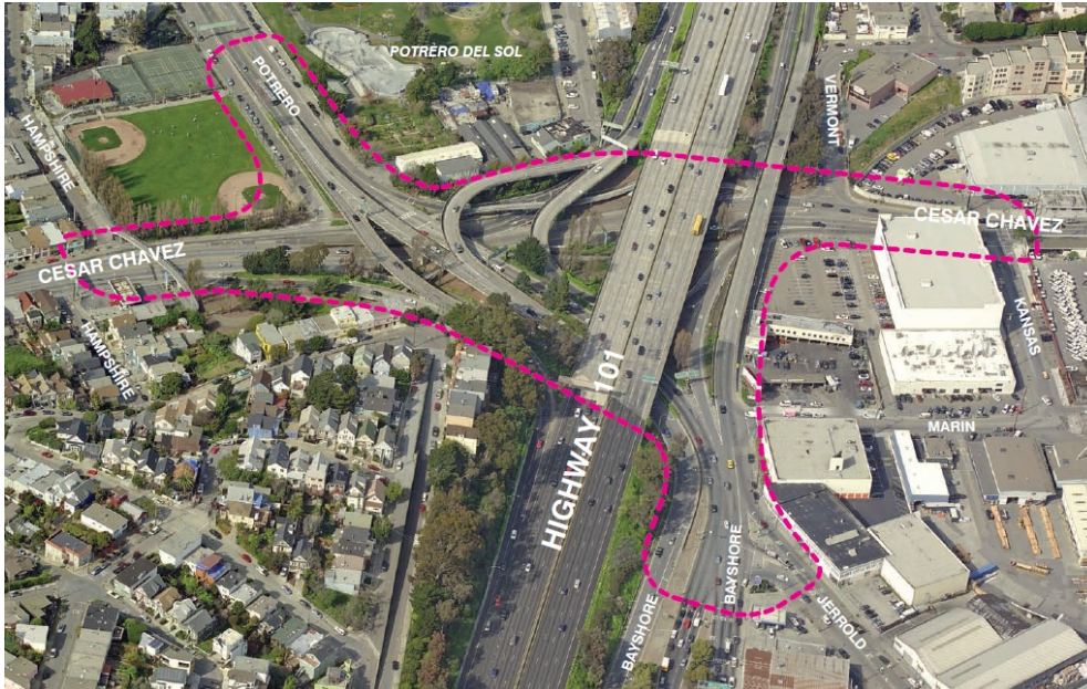
Cesar Chavez Street, Bayshore Boulevard and Potrero Avenue (The Hairball) Project Area

The Hairball Intersection Improvement Project is an effort to make key portions of the Hairball paths safer and easier to use for pedestrians and bicyclists. The project builds on previous planning efforts including the Cesar Chavez East Design Plan and aims to support citywide efforts such as WalkFirst, Vision Zero, and the SFMTA 2012 Bicycle Strategy to improve non-motorized safety and mobility in San Francisco.