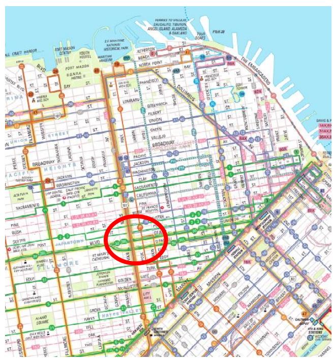
Map showing location of the proposed Cathedral Hill Campus at Geary and Van Ness in relation to existing transit lines

To accommodate expected travel demand arriving by private vehicles, CPMC is proposing to add 818 new parking spaces, in addition to the existing 172-space parking garage at the 1375 Sutter Medical Office Building. Current plans call for the construction of a 276-space parking garage for the Cathedral Hill Hospital and a 542-space parking garage for the Cathedral Hill Medical Office Building, although CPMC is studying the best way to distribute the new spaces between these two facilities. The reduction in the size of the hospital would increase the amount of parking in the vicinity of Geary and Van Ness, although not to the level as previously proposed (990 v. 1227 spaces).