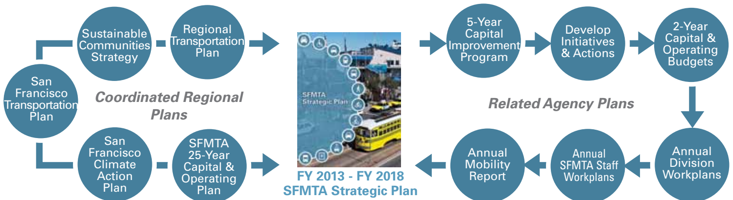
Figure 1: Relationship between the FY 2013- FY 2018 SFMTA Strategic Plan with other regional and SFMTA plans

In addition to the regional plans, the San Francisco County Transportation Authority (SFCTA) is the designated congestion management agency for the city and, in coordination with the SFMTA, develops the 25-year long-range transportation plan for the city and county. The SFMTA and SFCTA are collaborating on the development of the San Francisco Transportation Plan, drawing heavily from regional planning efforts, demographic projections and local long-term land use development plans. Lastly, the Agency develops internal multimodal and modal mid- and long-range plans for transportation capital and operational needs. The Capital Plan provides an unconstrained prioritization of capital needs and filters projects based on performance criteria. The five-year Capital Improvement Program includes those multimodal capital needs that can be delivered in that funding timeframe.