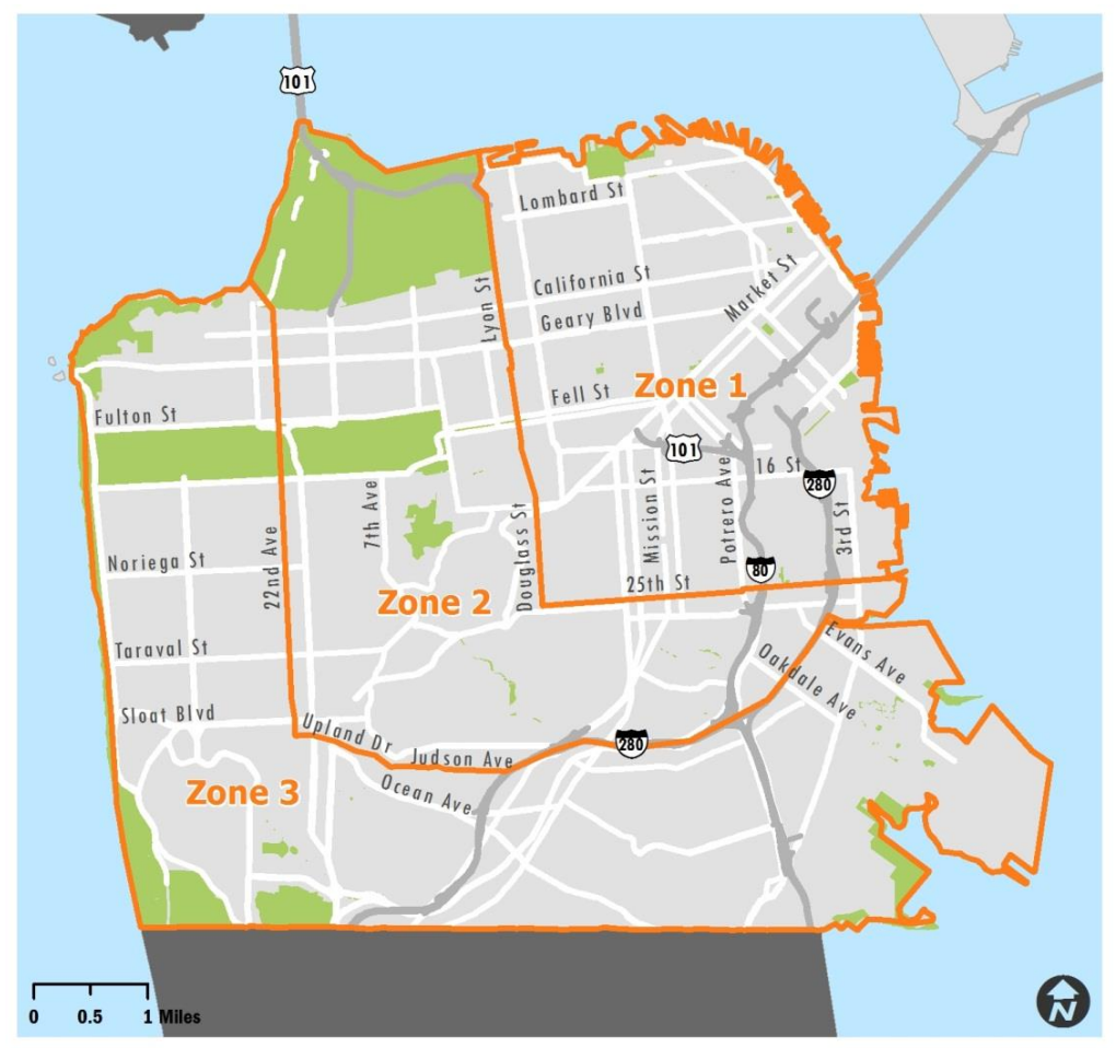
Figure 1: Shared Vehicle Parking Permit zones for parking lot and on-street permits