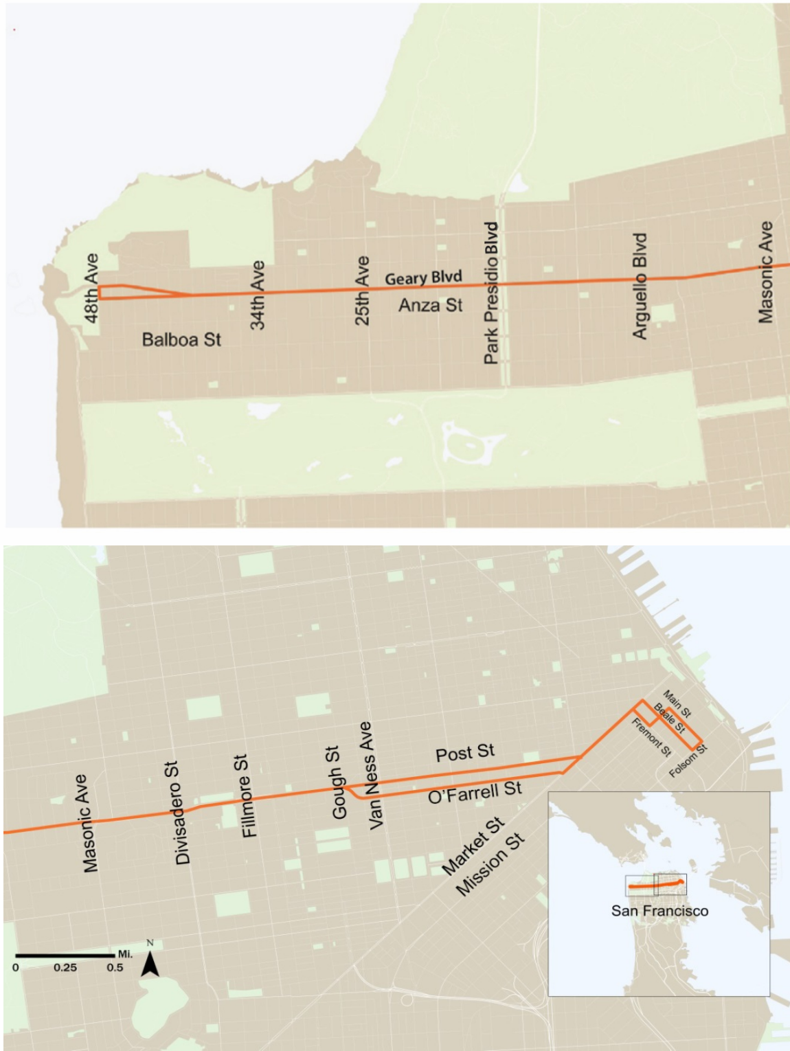
Figure 1-1 Geary Corridor