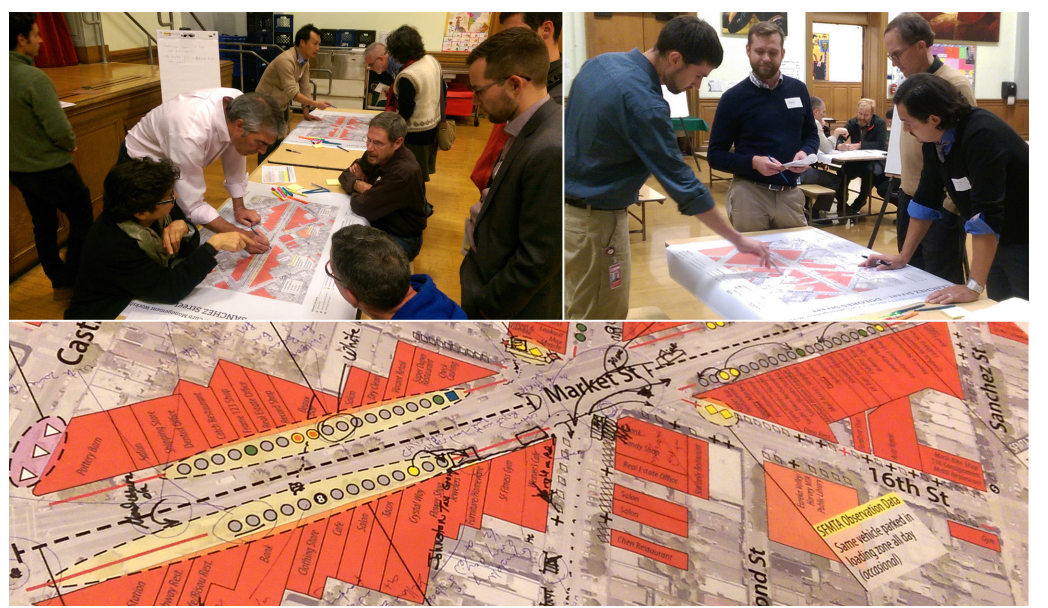
Curb Management Workshop - October 2015

Beginning in April 2015, the SFTMA hosted 7 Public Open House Meetings to notify the public about the project, soliticit feedback on designs or project proposals, and gather input on safety issues on the street.