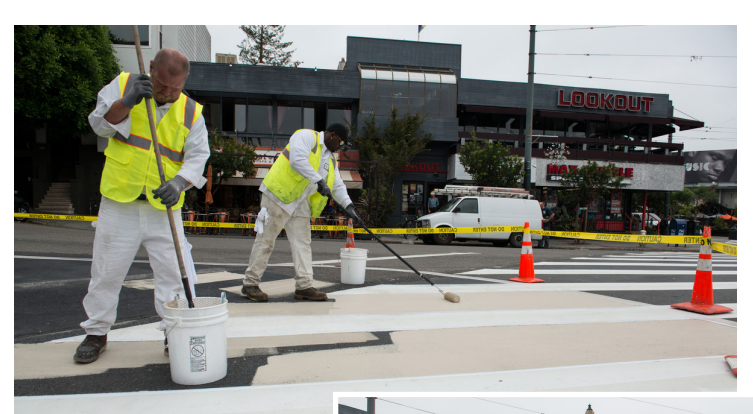
Painted Safety Zone event - August 2015