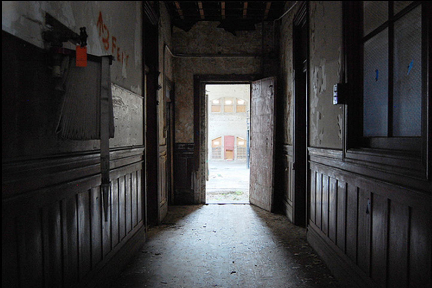
View of Powerhouse from Office Building Corridor