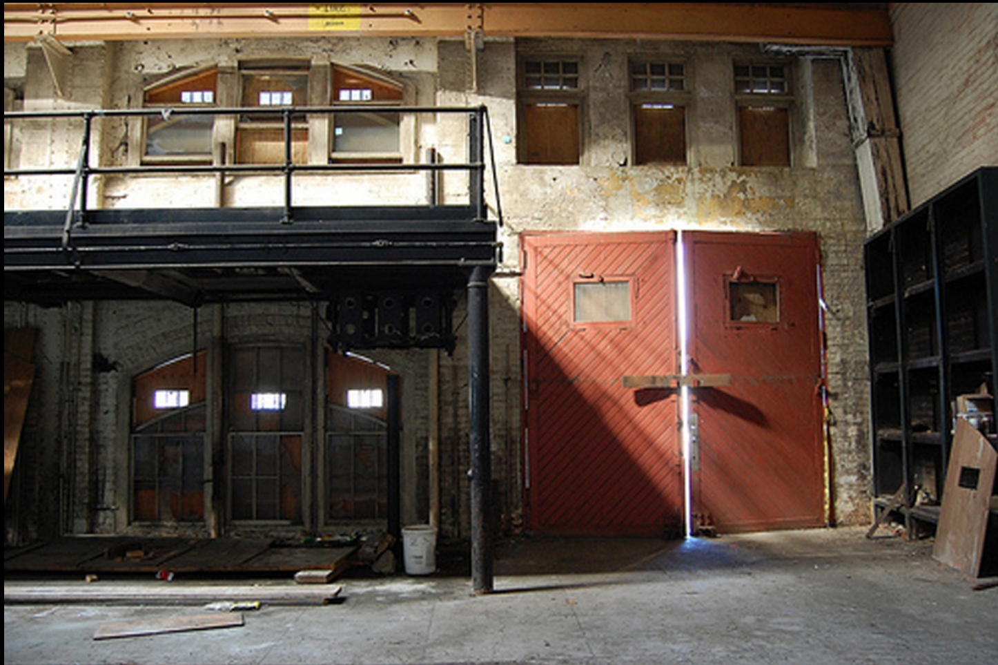
Mezzanine and Barn Doors