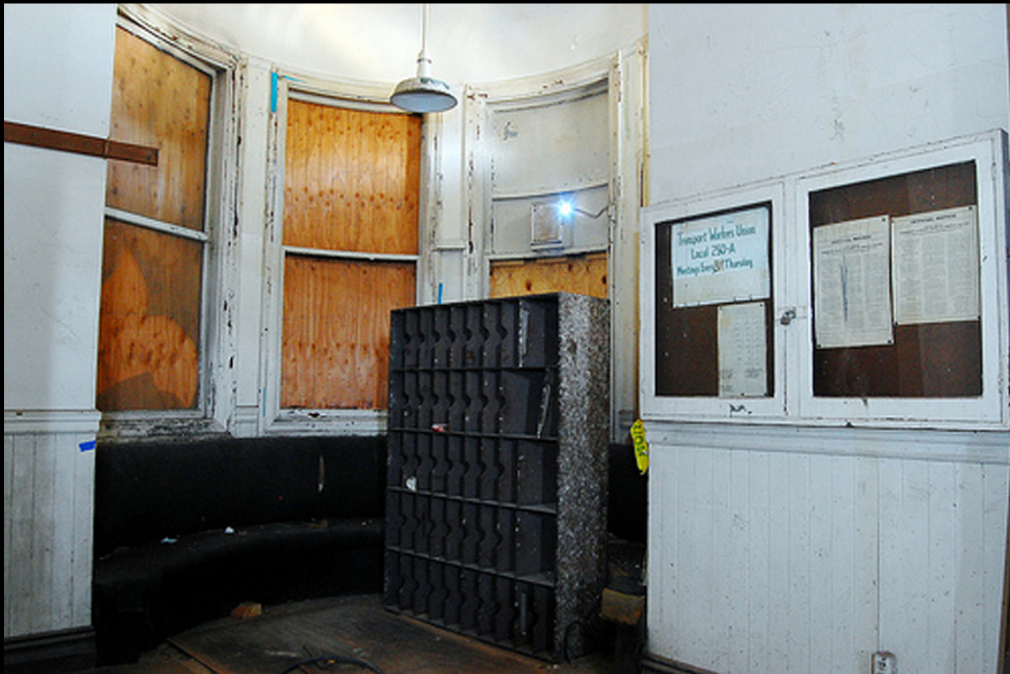
Corner Turret Space