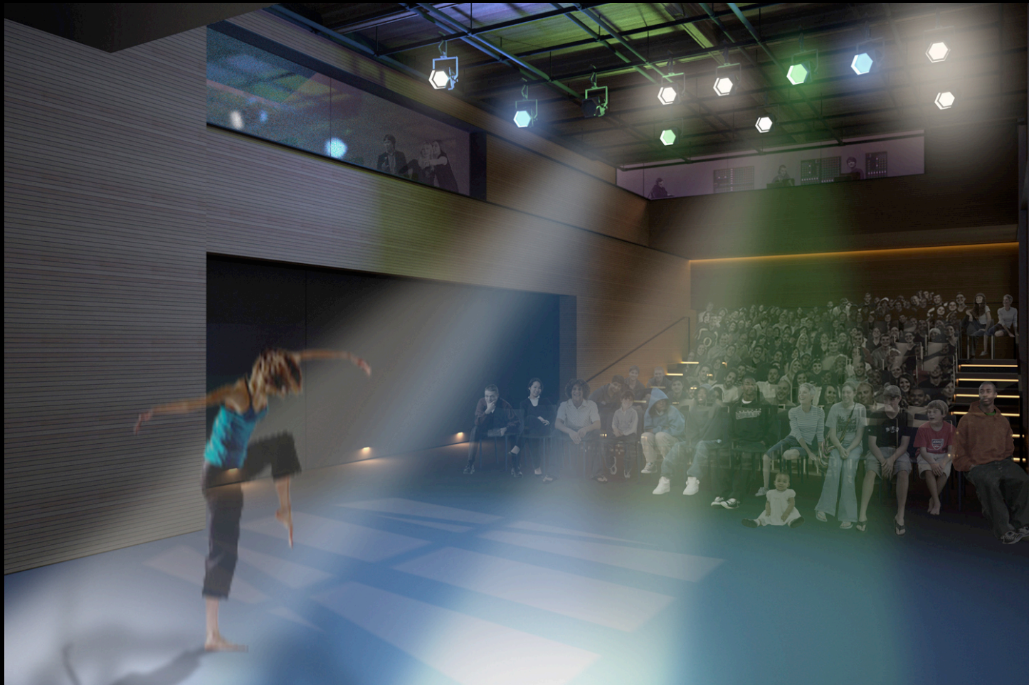
Performance Space at Night