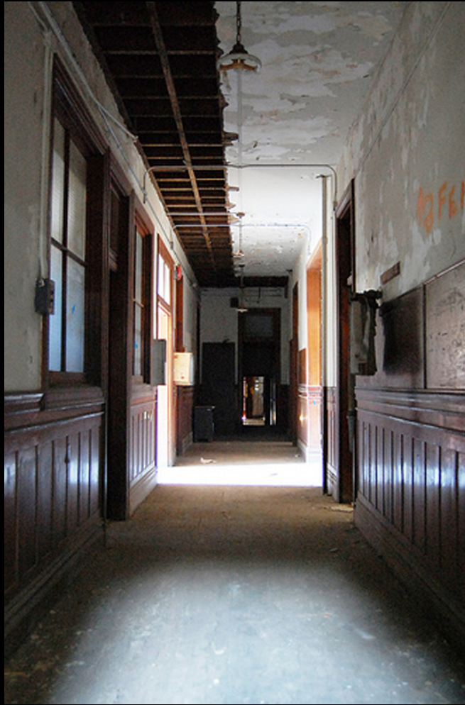
Original Wainscot and Woodwork