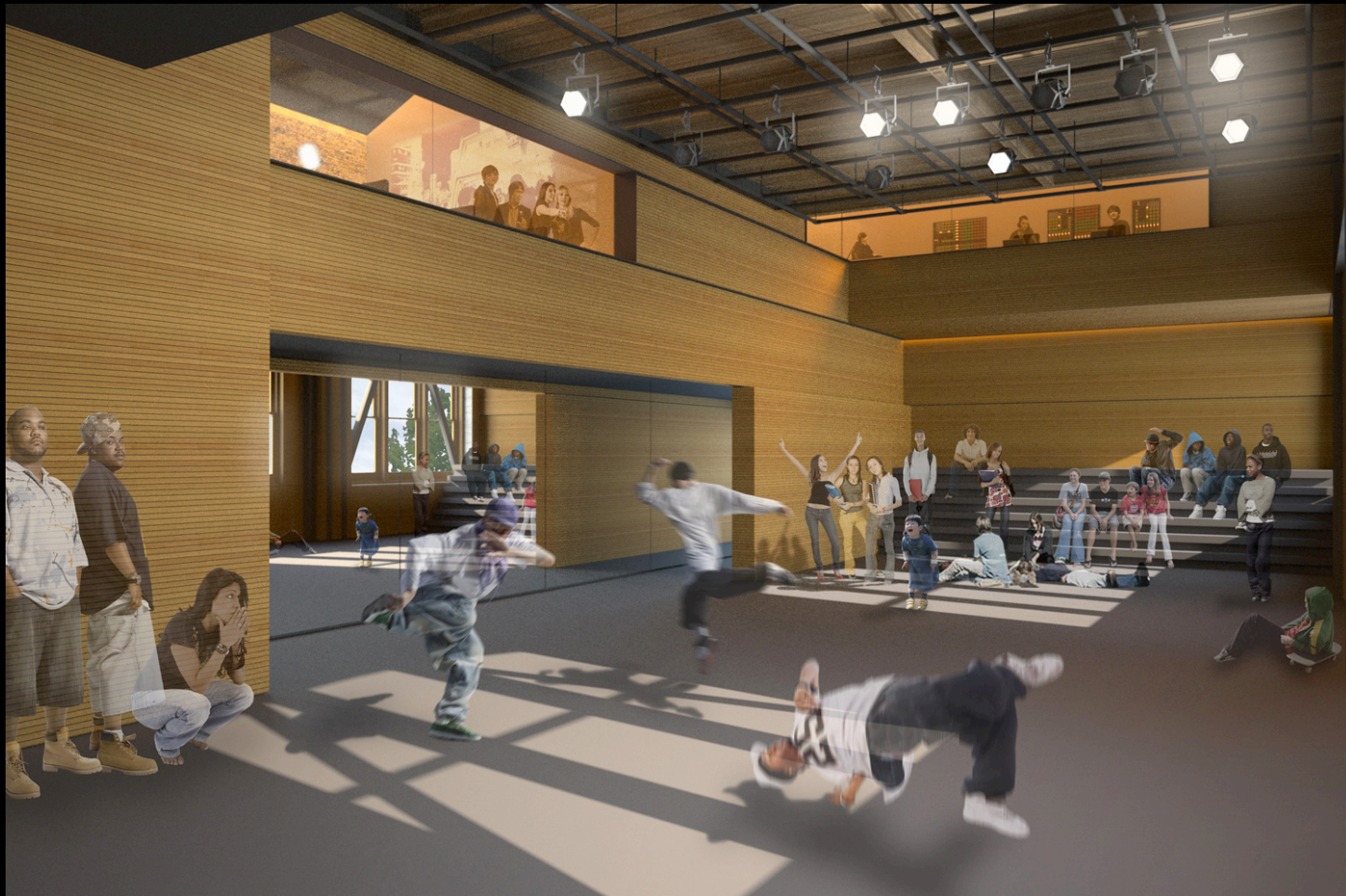
Practice Space by Day