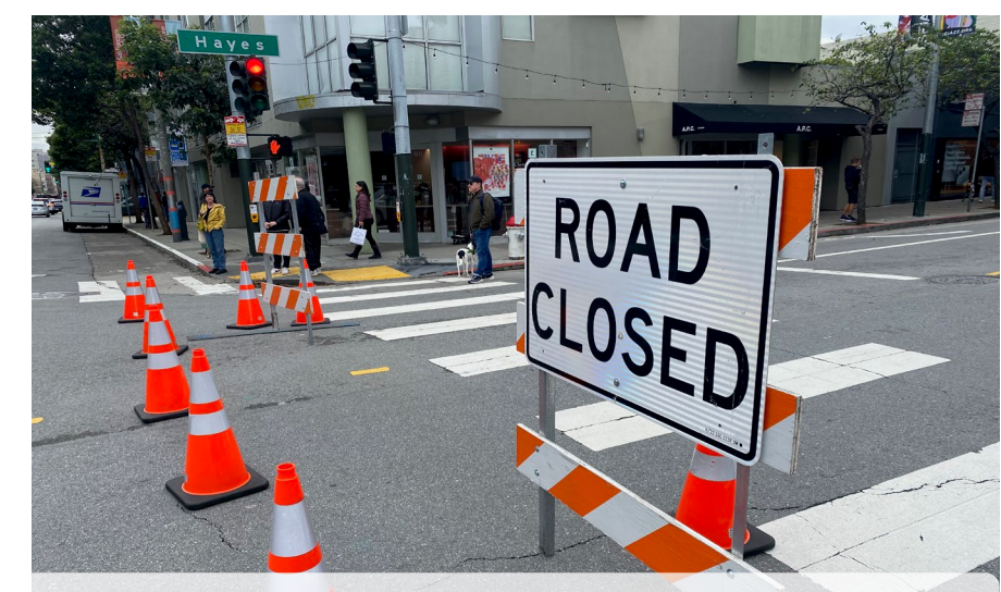
Gough intersection barricades, February 2024