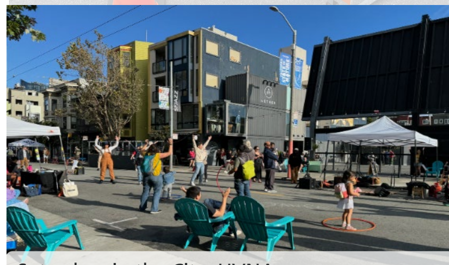
Saturdays in the City, HVNA