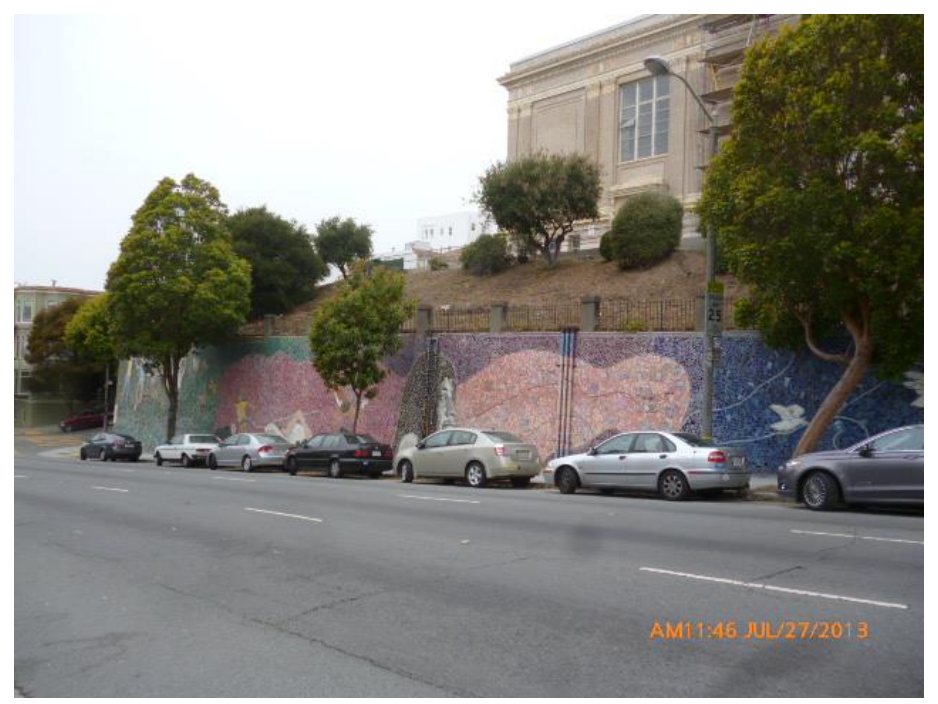
Figure 10 – North side of Fell Street east of Pierce Street

One disadvantage of this location for a tour bus loading zone is that it is just west of the crest of the hill of Fell Street. If buses do not pull all the way over to the curb when stopping at this zone, they could interfere with traffic flow in the right lane of Fell Street. Double-parked vehicles would not be visible to westbound motorists until they have crested the hill just west of Steiner Street.