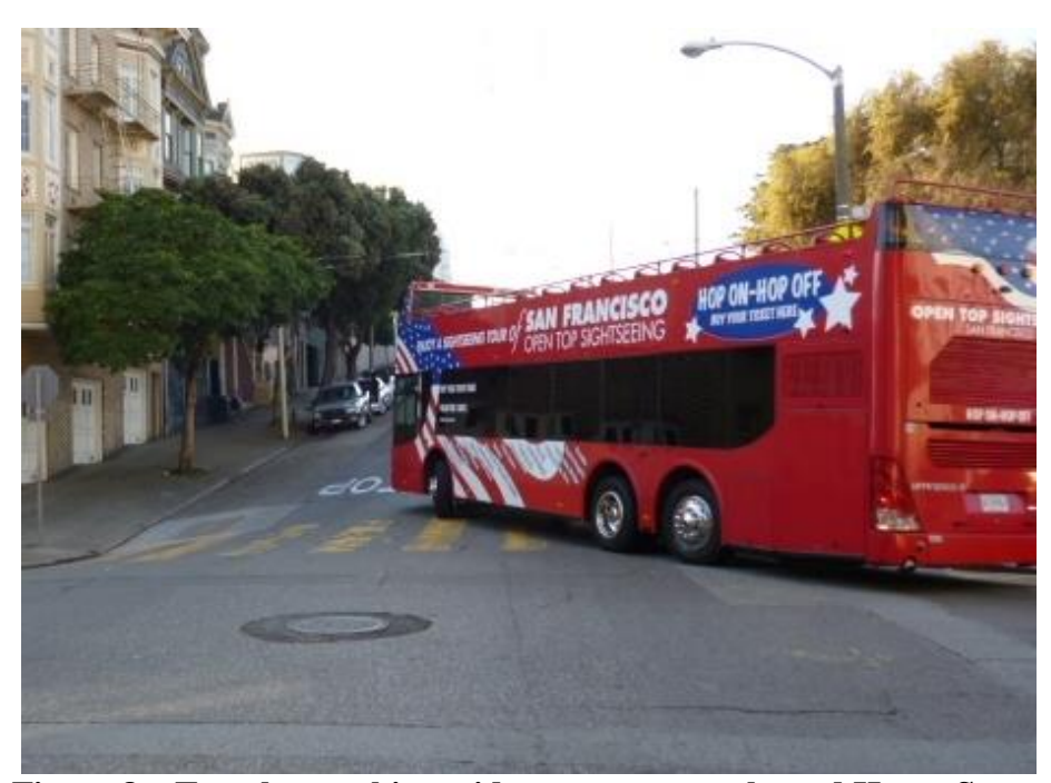
Figure 8 – Tour bus making wide turn onto westbound Hayes Street