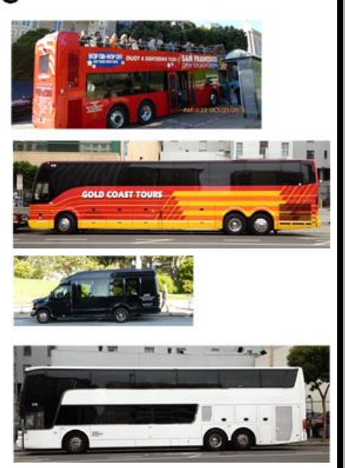
Figure 4 – Volume of buses by type of bus - 2013 Observations