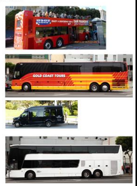
Figure 3 – Volume of buses by type of bus - 2011 Observations

In mid-2012, members of the San Francisco Tour Operators Association (SFTOA), an organization of local hop-on and hop-off bus operators and conventional tour bus operators, voluntarily stopped operating their buses on the streets immediately bordering Alamo Square Park and either relocated to nearby streets such as Fell and McAllister streets or stopped operating in the Alamo Square area completely.