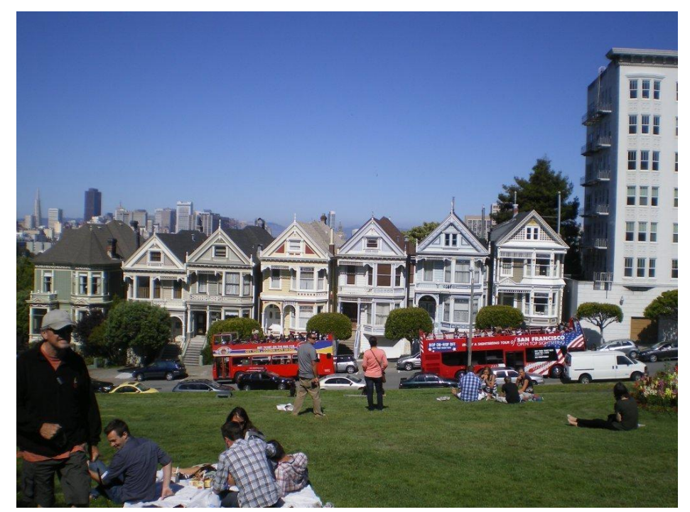
Figure 1 - View of Victorian homes on Steiner Street from Alamo Square Park