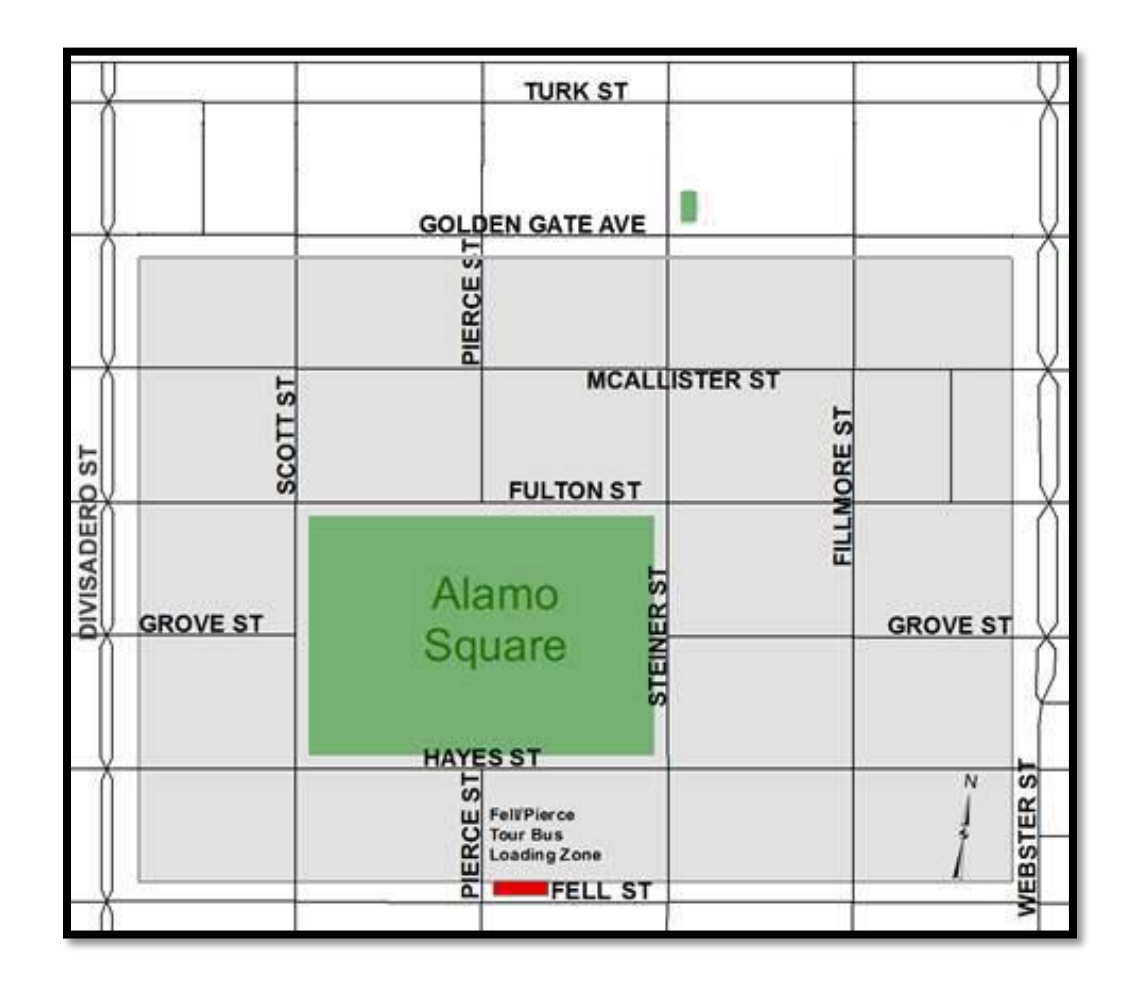
Option 1 – All streets north of Fell, east of Divisadero, south of Golden Gate and west of Webster restricted to commercial vehicles with nine or more seats except employer buses, tour bus loading zone on Fell Street east of Pierce Street