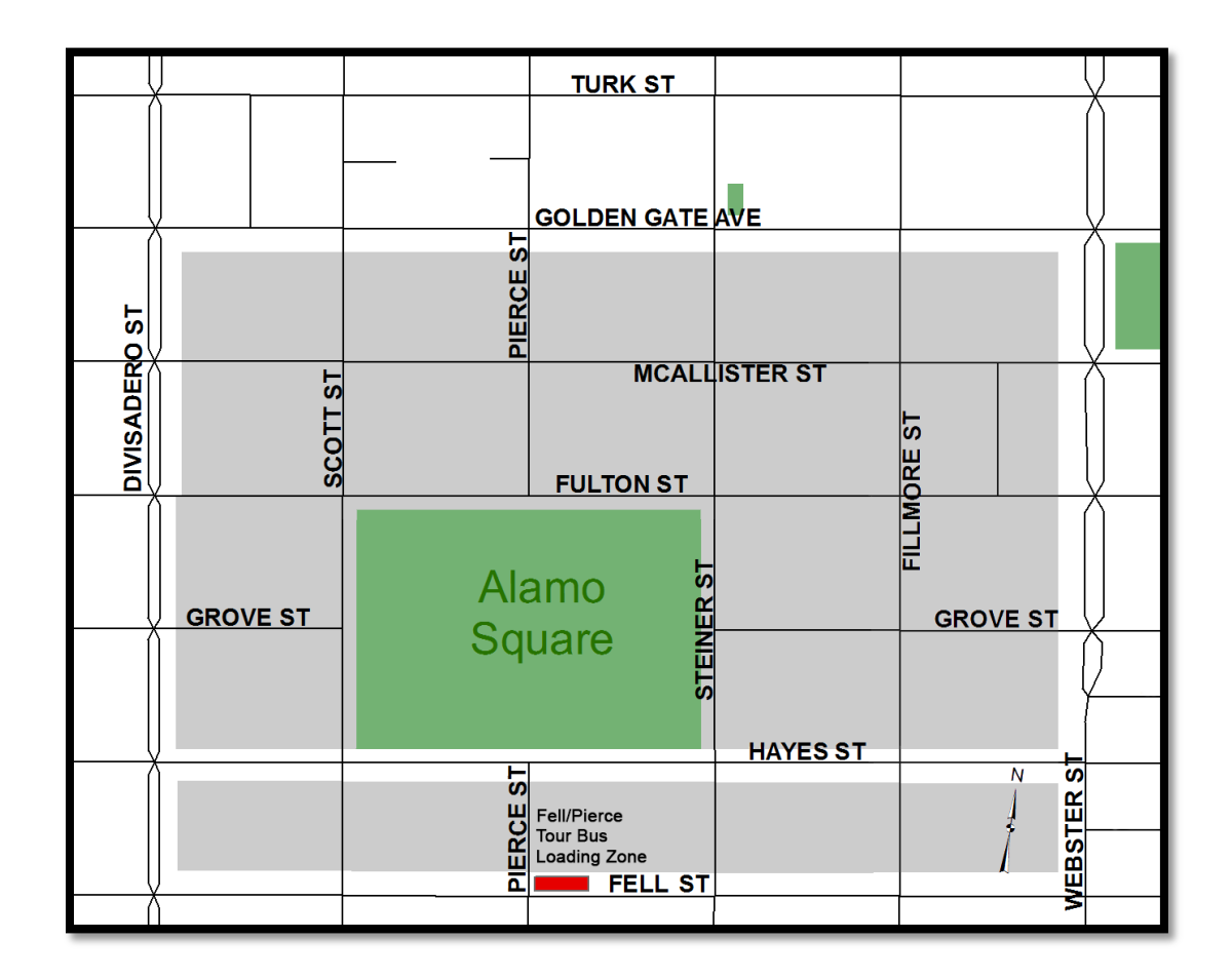
Option 2 — All streets north of Fell, east of Divisadero, south of Golden Gate and west of Webster restricted to commercial vehicles with nine or more seats except employer buses and enclosed buses would be allowed on Hayes Street, tour bus loading zone on Fell Street east of Pierce Street.

Option 2 would allow buses to operate on Hayes Street, but would not allow them to turn onto any of the narrow north-south streets between Divisadero and Webster streets (Scott, Pierce, Steiner and Fillmore streets). This would reduce the incidence of large vehicles having to make wide turns that cross over into the opposing traffic lane. The buses would be allowed to turn onto Divisadero and Webster streets, which are considerably wider. A drawback of Option 2 is that it would require a rigorous level of parking enforcement to prevent tour buses driving on Hayes Street from either slowing to very low speeds or stopping or parking illegally to allow passengers to view the Painted Ladies. The SFMTA Enforcement Division is not currently staffed to provide the level of enforcement necessary to prevent illegal stopping and parking on this section of Hayes Street.