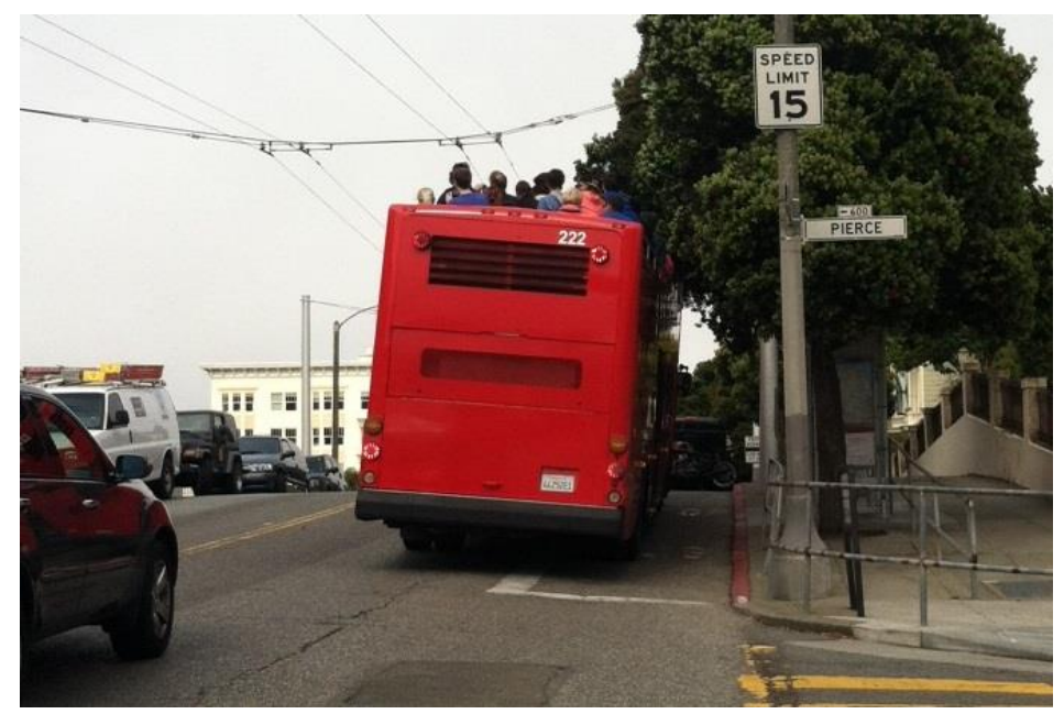
Figure 7 - Tour bus parking in Muni bus zone on Hayes Street