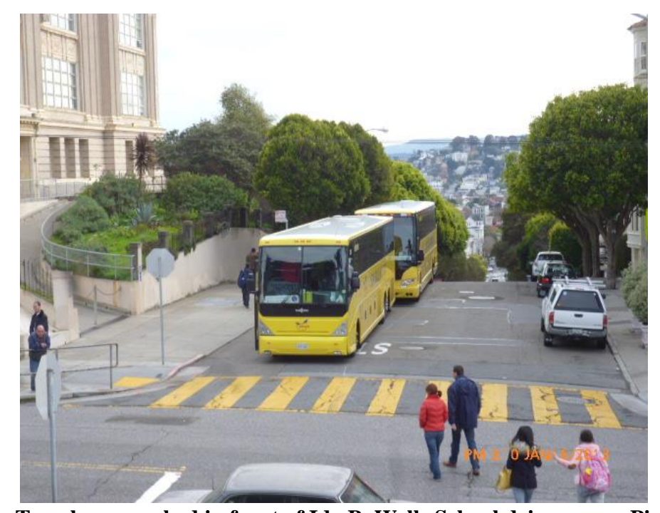
Figure 6 - Tour buses parked in front of Ida B. Wells School driveway on Pierce Street