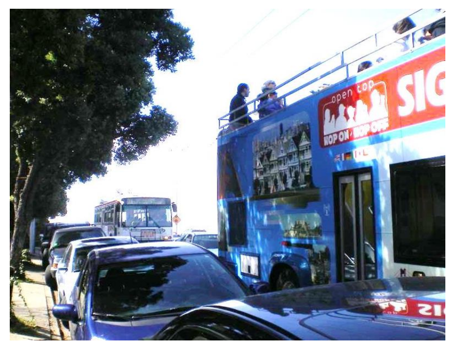
Figure 5 – A stopped tour bus on eastbound Hayes Street delays a Muni 21 Hayes bus