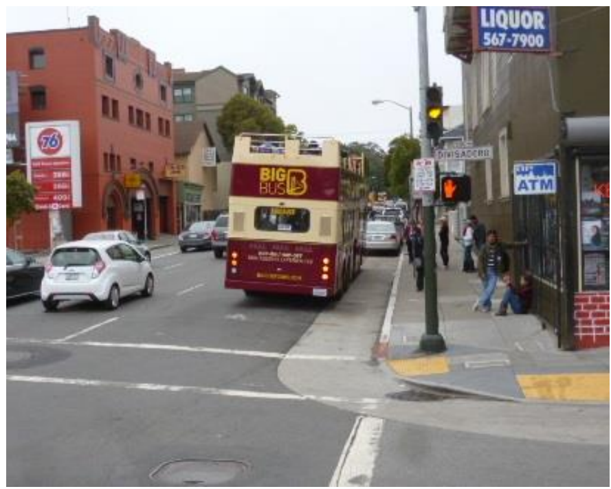
Figure 9 – Tour bus loading zone on Fell at Divisadero Streets

In order to reduce the impact of tour bus traffic directly around Alamo Square park but still provide a means for visitors to reach the Alamo Square area by tour bus, the SFMTA staff worked with ASNA, the Divisadero Street merchants and several local hop-on hop-off tour bus operators to establish a Tour Bus Loading zone on the north side of Fell Street just west of Divisadero Street. This zone was approved as a six-month trial in August 2012 and was established in February 2013. Residents of the mixed-use building adjacent to this tour bus loading zone have complained about the noise, vibration, parking and traffic impacts of this zone. The buses can cause vibration within the adjacent building and the use of amplified loudspeakers while the bus is stopped can also be disruptive to residents. Additionally, if buses do not pull over all the way the curb when stopping at this zone, they block the right traffic lane of Fell Street, as shown on Figure 9. The zone removed three metered parking spaces on Fell Street.